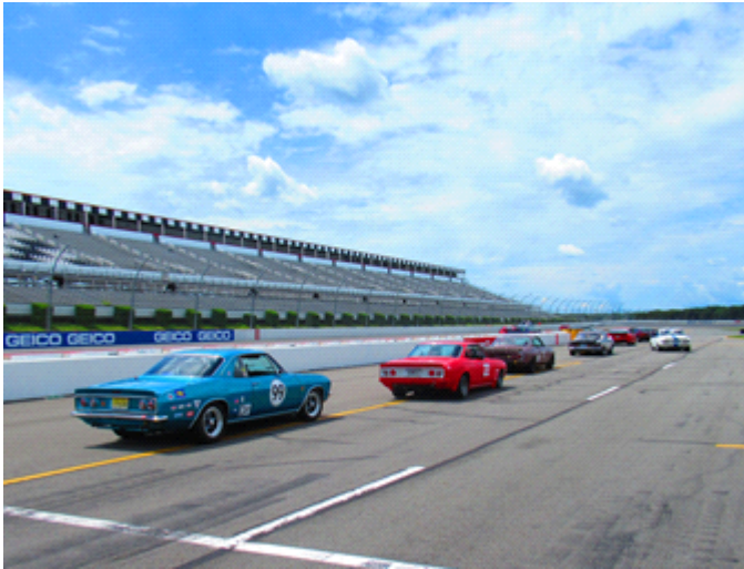
Corvairs on the grid at Pocono.