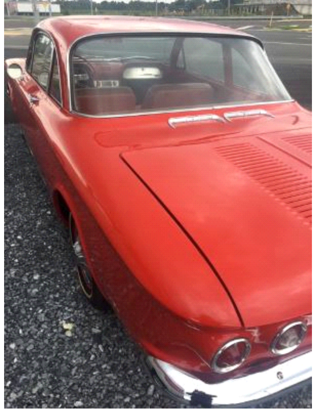
Corvair in Need of Rescue. Sitting next to the garage at Hassler's Automotive on Route 422 in Womelsdorf, PA. "Ran when parked". Nice shape. Needs tender loving care.