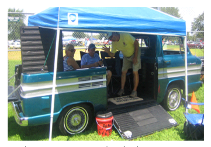
Rich Greene enjoying the shade!