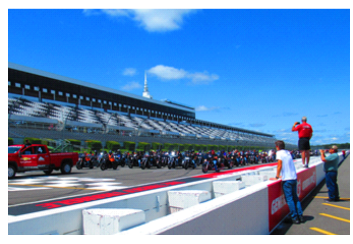
658 Harley Davidsons during lunch hour.