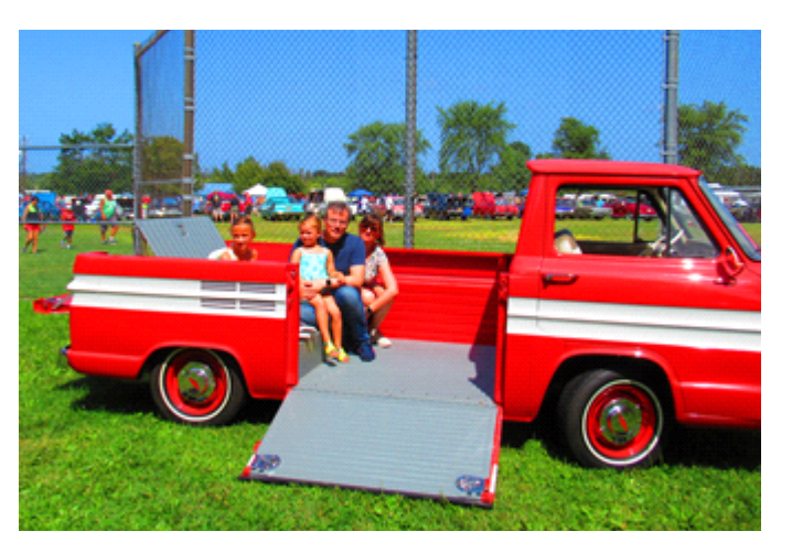
Wes, Angela and their daughters