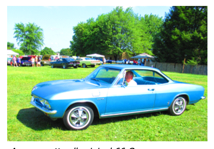
A very pretty all-original 66 Corsa