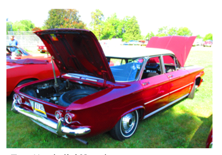
Tom Hambel's '63 sedan