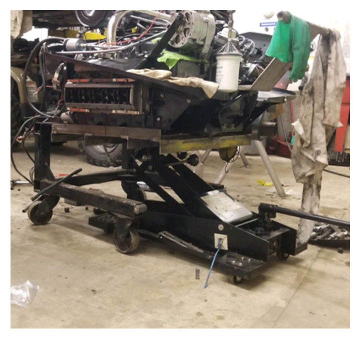
Above: This photo shows how Bob's engine cradle & jack combo mates up with his low-profile engine stand.

Below: Pull the jack out from underneath the test stand and now the engine is ready for testing!