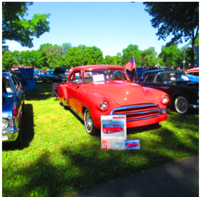
Not a Corvair, but at least one of us should be familiar with this Chevy BelAir.