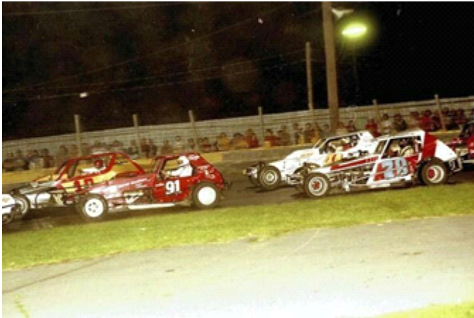
Dorney Park

As a recent transplant to the Lehigh Valley, I find that I miss the old Dorney Park Speedway a great deal. I spent plenty of Saturdays, and a series of Wednesdays, on the microphone at Dorney Park. This was in the early 1980s, and to get there from my North Jersey home at the time I often drove my “Ratvan II” 1962 Greenbrier.