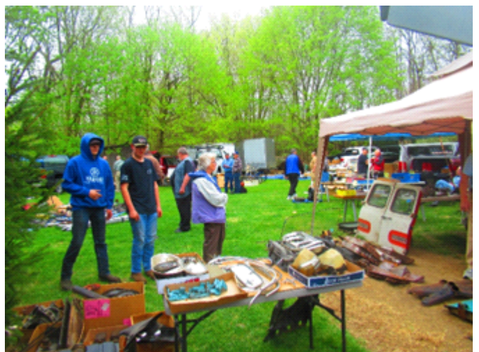
So many parts for sale at the LVCC Swap Meet!