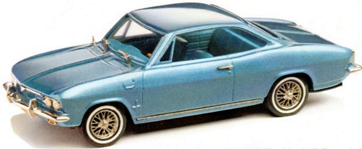
Brooklin's BRK-139 1967 Corvair Monza coupe finished in Nantucket Blue Poly.

We are proud to announce the release of BRK-139 1967 Corvair Monza coupe and the BRK-145 1959 Chevrolet Brookwood station wagon finished in Harbor Blue Poly.