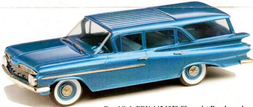
Brooklin's BRK-145 1959 Chevrolet Brookwood station wagon finished in Harbor Blue Poly.