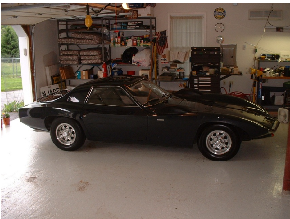
Molto Bene!!!! The Phoenix looking "primo" after the detailing session!