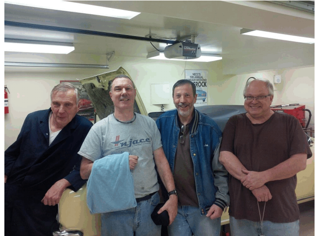
Tired but happy