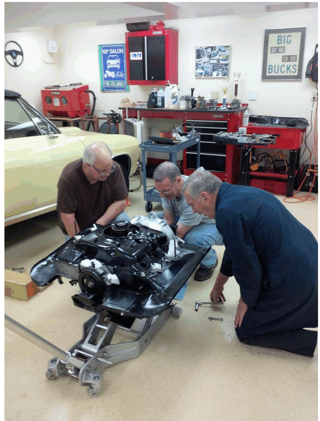
Insert Tab A into Slot B