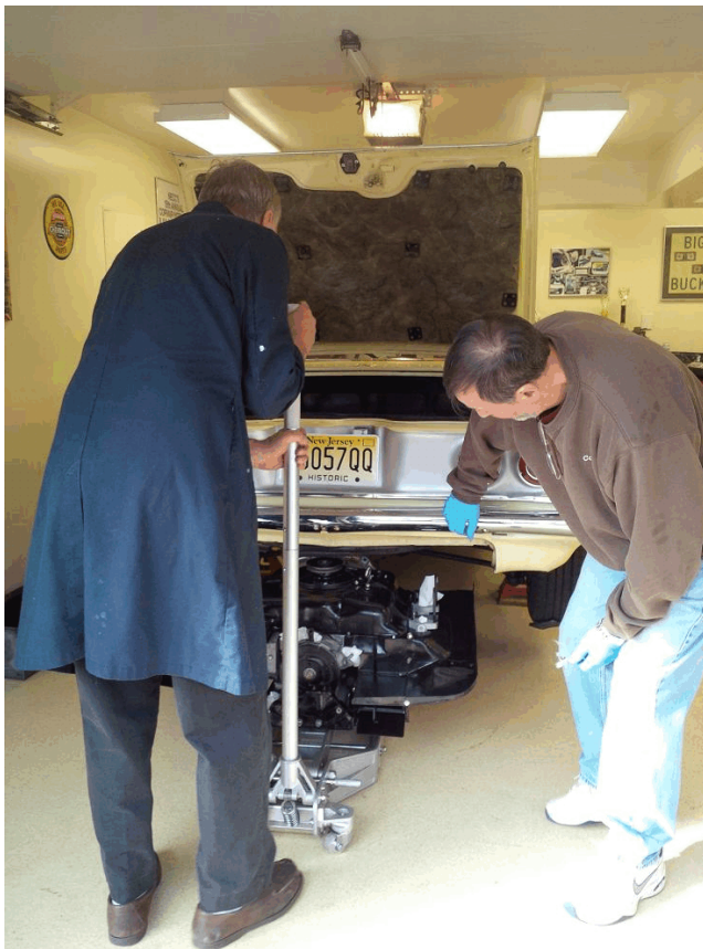
In a remarkable feat of strength, just one hand lifts the car while the engine is rolled into place!

Once the "package" was complete, the physical and creative part began of jacking up the engine into the compartment. While some near misses occurred with the jack, all went well and nuts and bolts were tightened securely into place. At that point, Brian gently dismissed us.