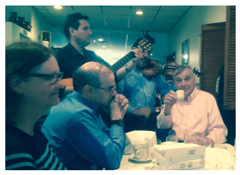
And, below, from Rob Wanthouse: "Proof that music soothes the savage beast!"

Throttle Adjuster as per Ken Schifftner's Tech Tip on Page 4 ←