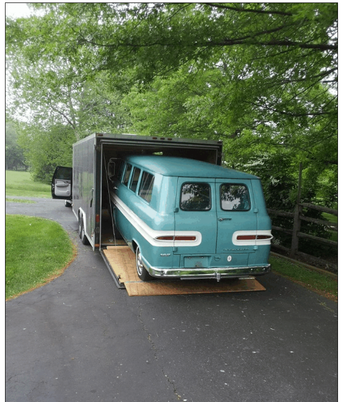
The Greenbrier Departs, May 18, 2015