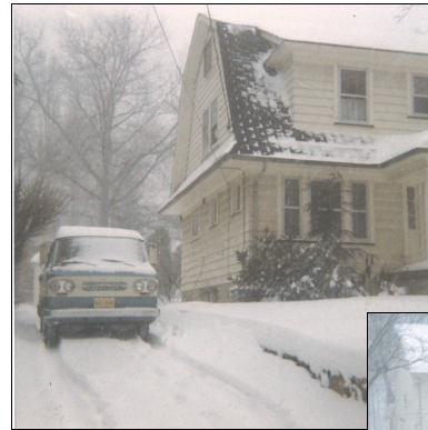
January, 1966 Ridgewood, NJ

In January, 1966, my father bought a Greenbrier. Not his first Greenbrier, and in fact it was the sixth Greenbrier he had purchased, starting with a showroom-new '61 in the Fall of 1960.