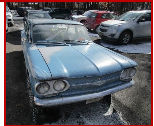
The Corvairs that braved the snowy and salted roads for our Parts Auction on February 13