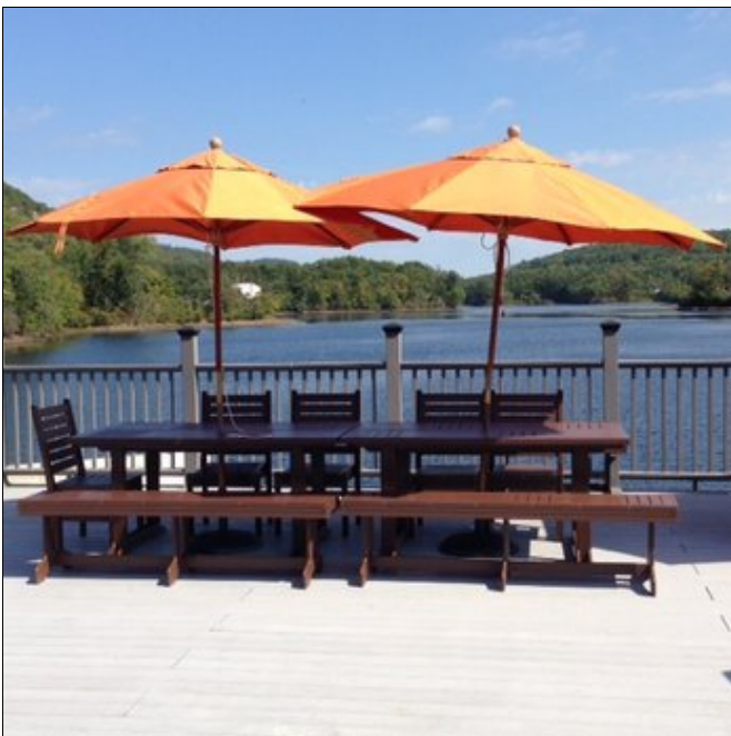
Bucky's on the Lake