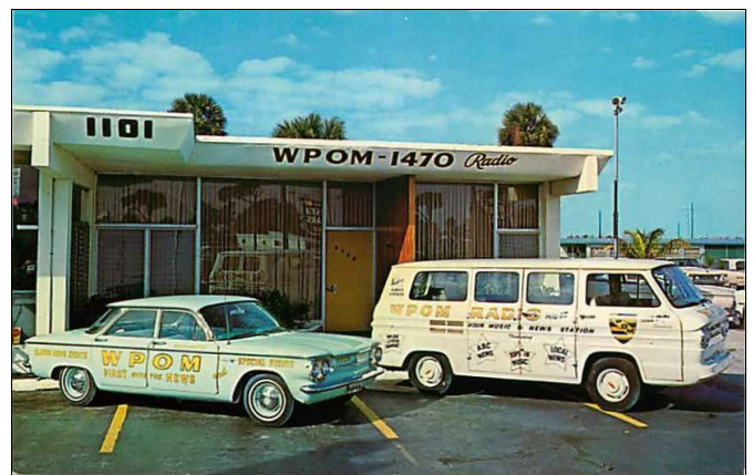
Vintage post card from WPOM in Fort Lauderdale, Florida. Neat fleet!