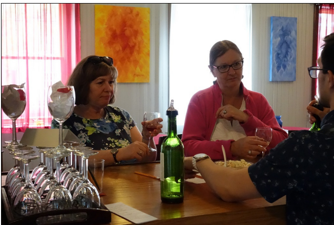
Wine-Tasting in Jim Thorpe

If you are not coming out for our club tours, you’re missing out on the fun!