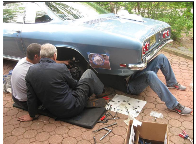
The Roving Wrenches at work... or perhaps one of them is napping...