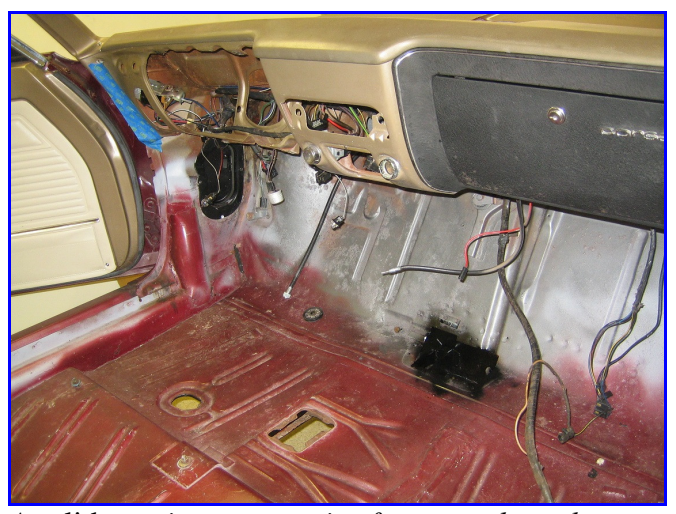
A <u>solid</u> car, in an attractive factory color scheme of maroon exterior with beige interior