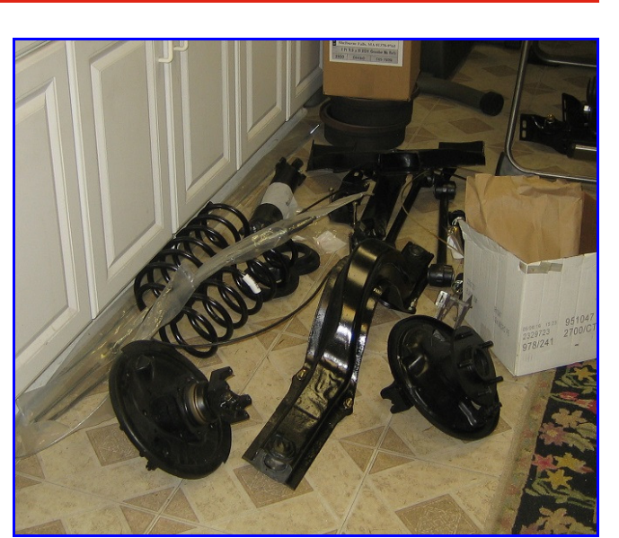
Suspension pieces waiting to be assembled