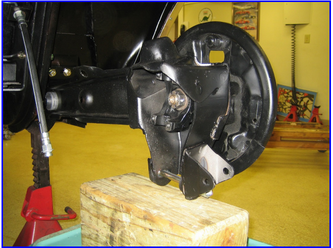
Clean parts and new hardware