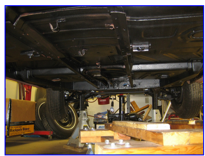
An undercarriage cleaned of 50+ years of undercoating and dirt, and repainted