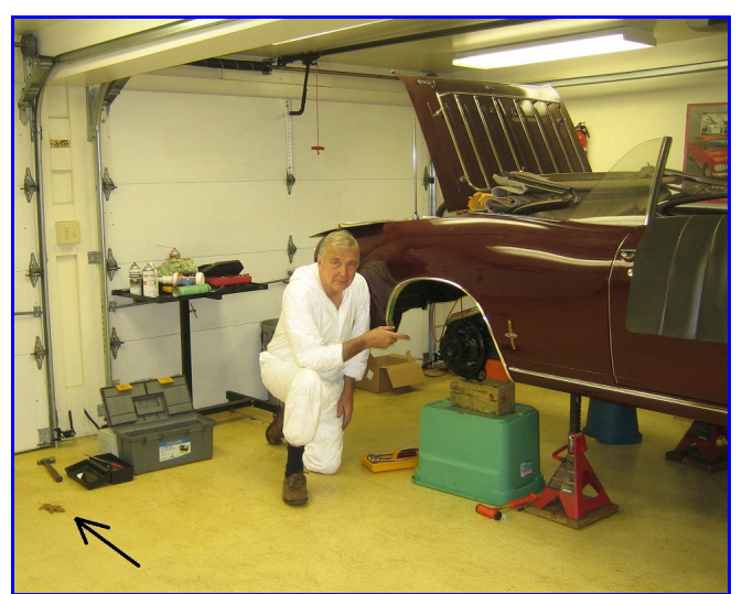
Doctor! Wait! There's a leaf on the floor of the operating room!