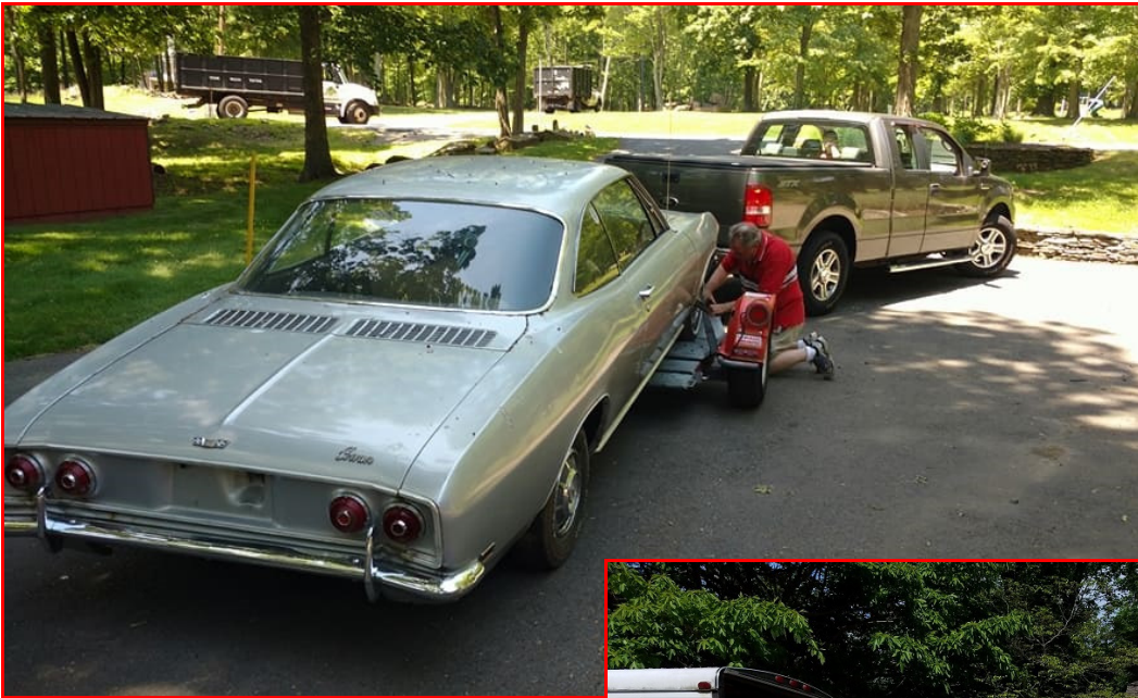
← Curt & Michael Stone pick up a 1969 Monza coupe