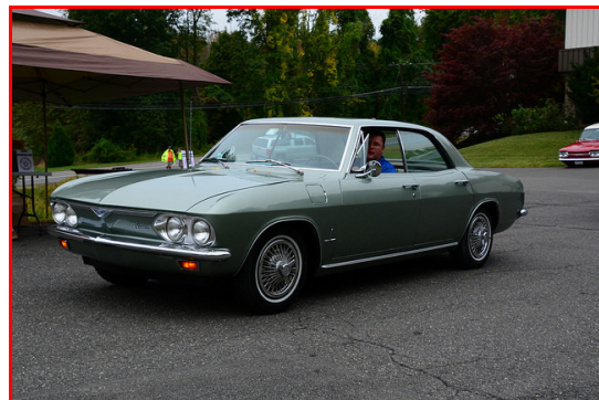
The Stone Family '66 Monza