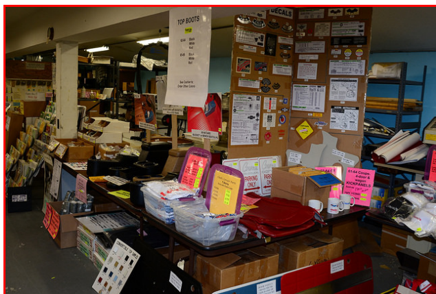
... and more Parts!