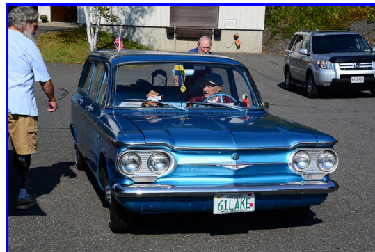
This gentleman drove his Corvair from New Hampshire to the show. He is 99 years old! What was your excuse again?