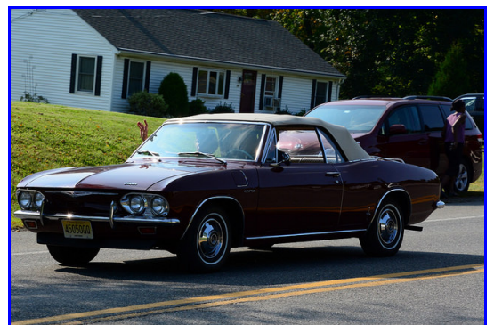
Bernie Fisher's '65 Corsa