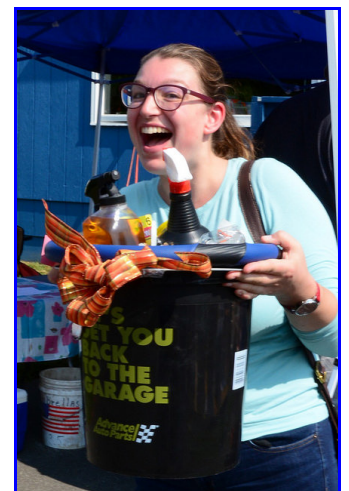
Door Prizes were plentiful