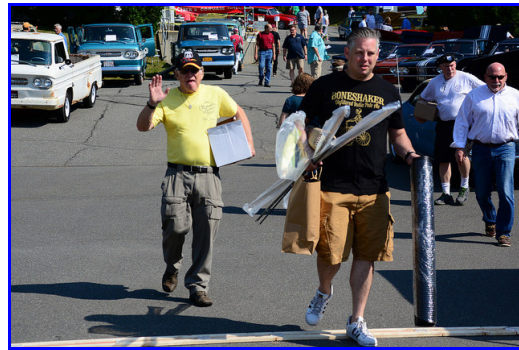
Parts on the move...