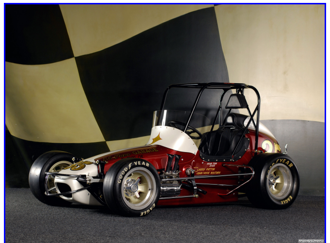
An Edmunds Midget, circa 1976