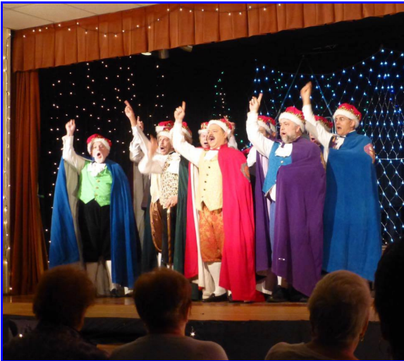
← The Treasurer Sings