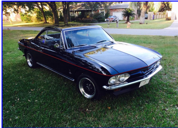
← The Corvair Makes It to South Carolina