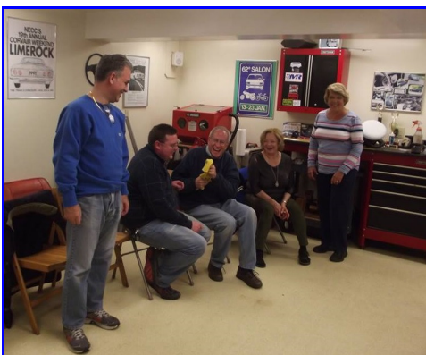
At left, members pay rapt attention.