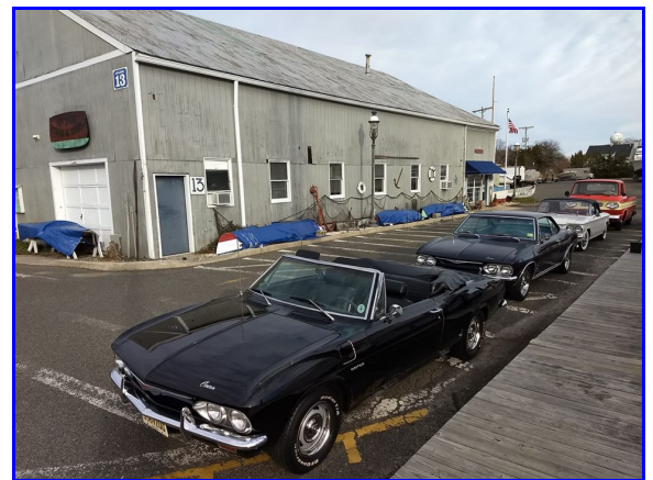
Corvairs depart the Museum →

The Fanbelt is published monthly by the New Jersey Association of Corvair Enthusiasts (NJACE), Inc. P.O. Box 631, Ridgewood, NJ 07451. Deadline for contribution is the 20th of each month. Classified-style advertising of interest to Corvair owners is available, free of charge, to all persons. A commercial ad can be placed in an issue of the Fanbelt for $50 per full page, $30 per half page, $20 per quarter page, and $10.00 per business-card. (Generally, classified advertisers are those offering individual cars and/or a limited number of parts, while commercial advertisers are those offering services and/or parts from stock. NJACE reserves the right to make this determination). All advertising must be PC-compatible or type-able copy.