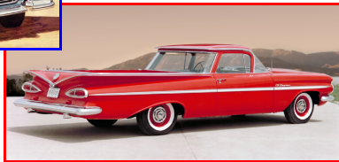
'59 El Camino →

But the El Camino was offered for only two model years, 1959 and 1960, before taking a hiatus and re-appearing for the 1964 model year, based on the new-for-'64 midsize Chevelle. Ford's Ranchero, in the meantime, had moved from the full-size platform in 1959 to the compact Falcon for 1960.