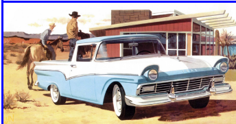
← '57 Ranchero

Knowledgeable Chevrolet Enthusiasts know that the El Camino debuted for the 1959 model year, based on the full-size Chevrolet and likely inspired by Ford's similar Ranchero, which had appeared for the 1957 model year.