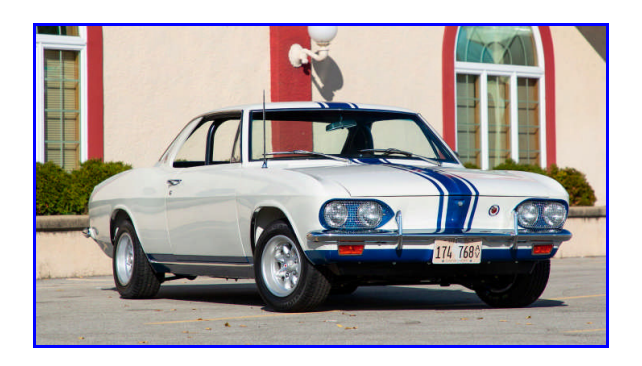
More photos on the next page

Nevertheless, the fact that a Stinger sold for $200,000.00 is an indicator of the respect Corvairs are attaining in certain quarters.