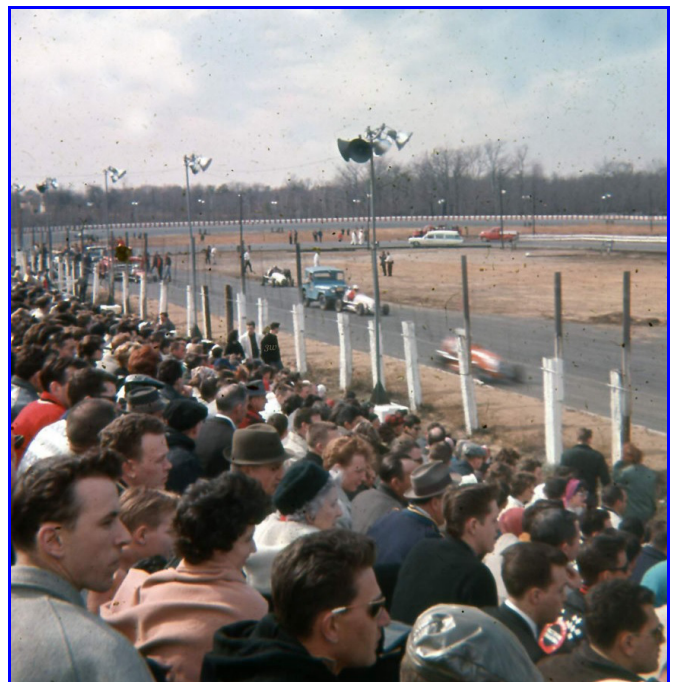
Old Bridge Speedway, 1959