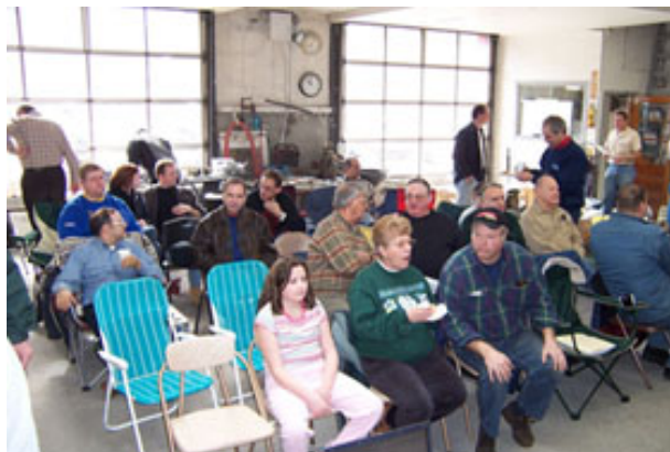
.....present items of interest to the anxious bidders!