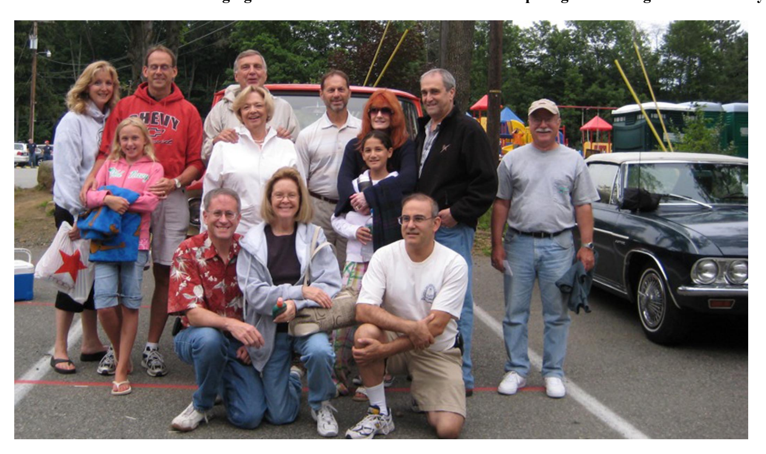
An NJACE group photo before enjoying the "Beatlemania Again" show at Camp Jefferson.