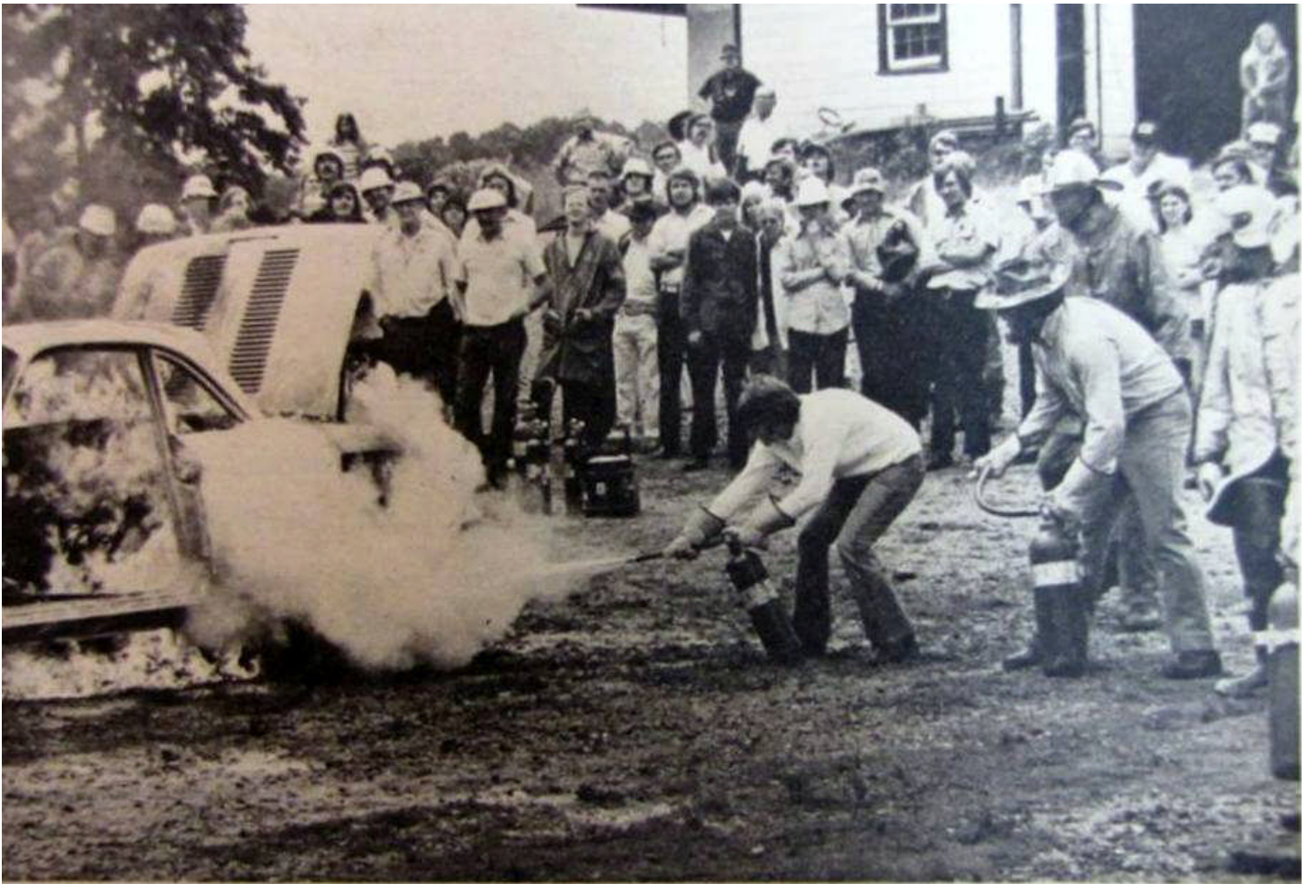
Real car fires were set to give actual experience in using extinguishers.