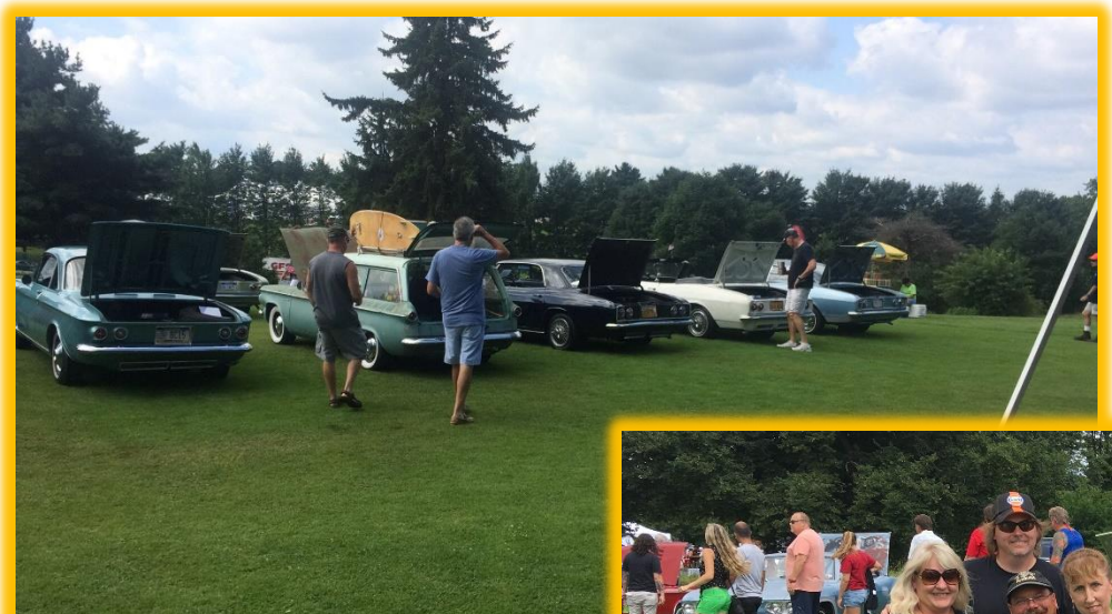
PITTSBURGH VINTAGE GRAND PRIX WPCC was well represented at this year's event, with both several Corvairs and several members in attendance.