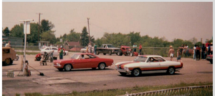
WPCC Corvairs line up at Keystone Raceway, circa 1970's.