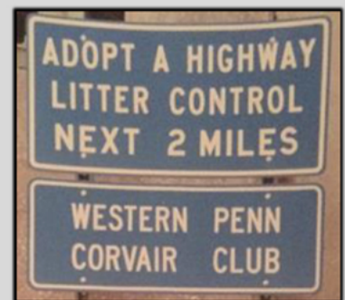
WPCC Community Effort...exact timeframe unknown, along with the whereabouts of whatever happened to this parkway sign?