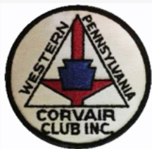
Our original logo.