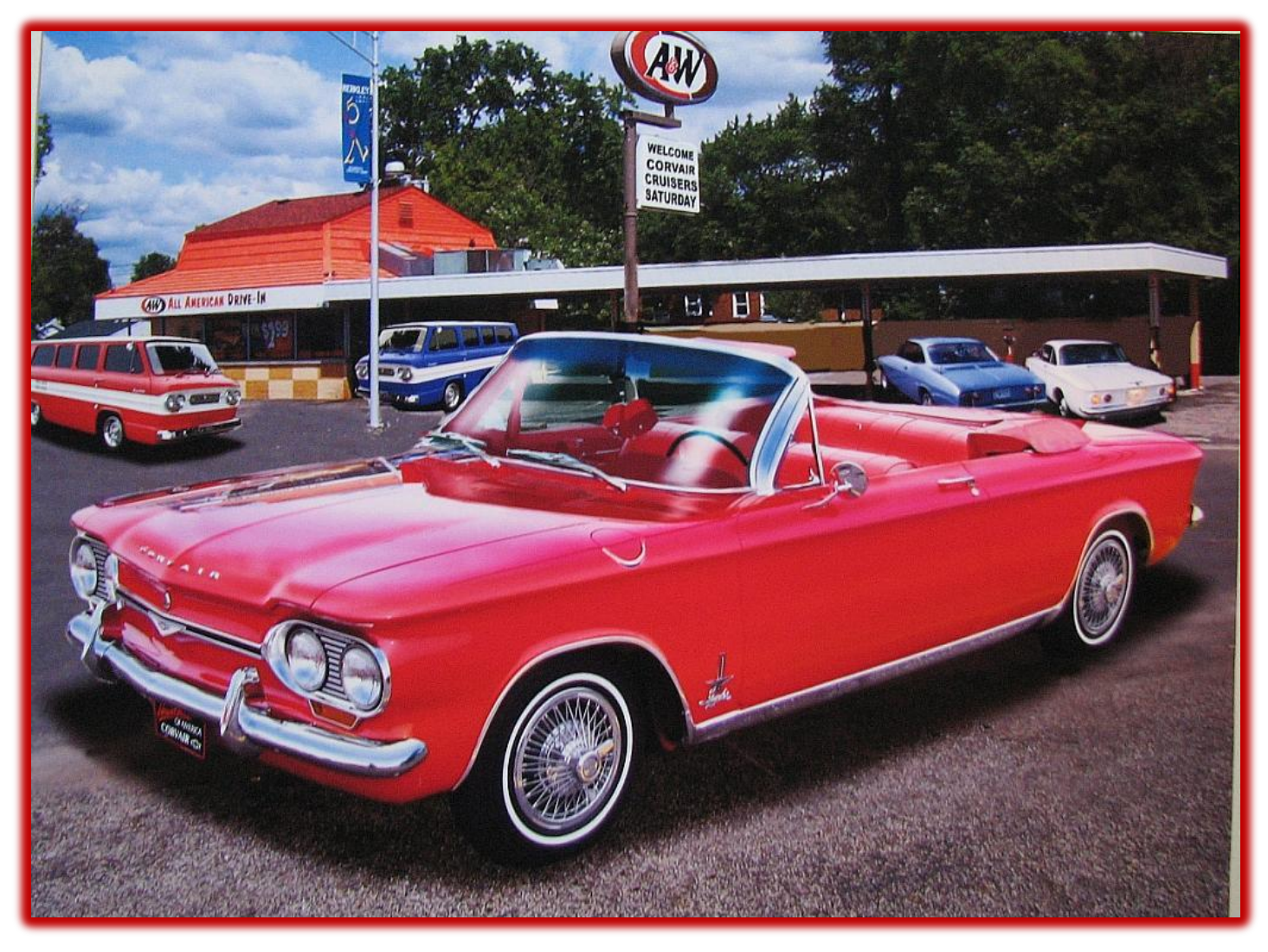
From the Corvair photo archives...A nice way to spend a summer evening...