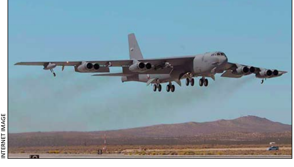
A Boeing B-52 Stratofortress Bomber takes off over a desert airfield.

During our upcoming visit to the Air Force Museum, perhaps we can allot some time to meet under the museum's B-52. I would love to answer your questions and explain the capabilities of this amazing bomber that first flew in 1952, and will probably remain operational into the 2040s. Compare this to the average 30 year life span of normal military aircraft. I'm sure that our talk will remind me of the many boring hours and moments of sheer terror in this plane, that I will relate to you.