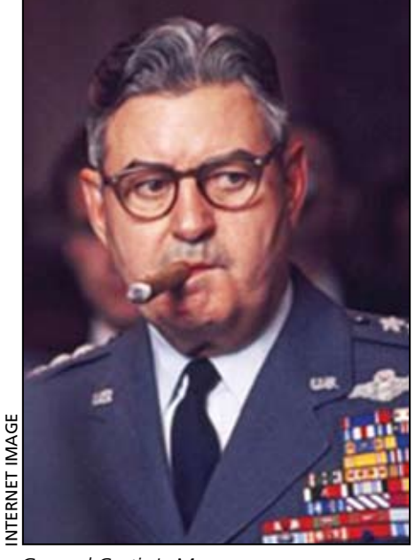
General Curtis LeMay

Not everyone was completely sold on the B-52. It was large, relatively complex and would require additional funding for suitable hangars, hardstands and runways. LeMay conceded all those points but insisted that the Stratafortress was worth the effort. In its capacious airframe he saw room to grow-and he believed the extra