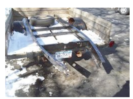
Frame going to Miller's Sandblasting