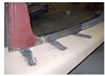
Modification to left front fender