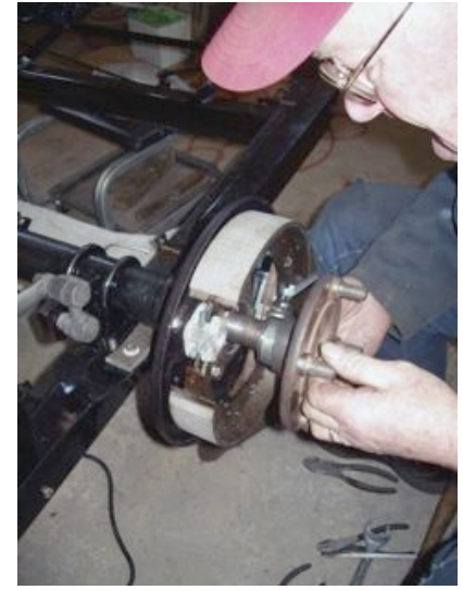
Gil assembles rear axle