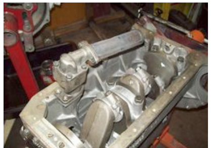
Bottom end of the Triumph engine