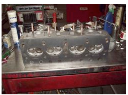
Top end of the Triumph engine