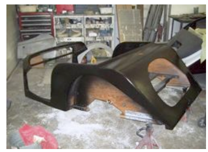
Body in primer