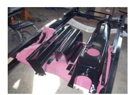
Frame & other parts after painting