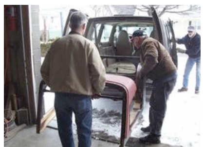
Body delivered to CARS Plus