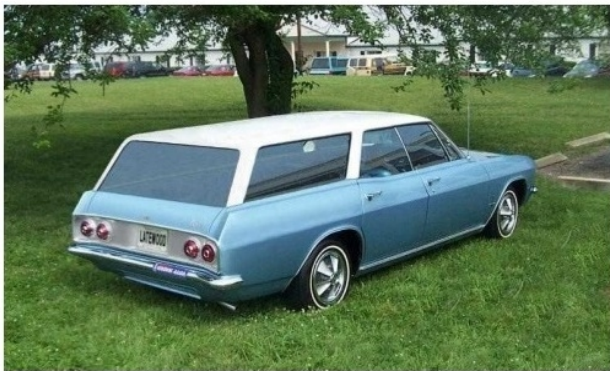
Recently found! Long lost Corvair prototypes. The late model wagon. Lakewood and Nomad style.

These pictures were published in the April 2023 issue of the Niagara Frontier Corvair Club newsletter. Keep in mind, it's April..