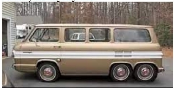
And the late model Greenbrier