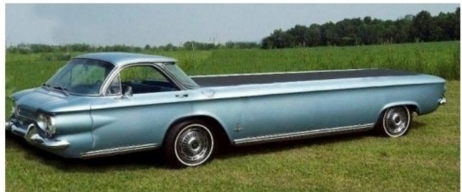
For heavy and long cargo loads