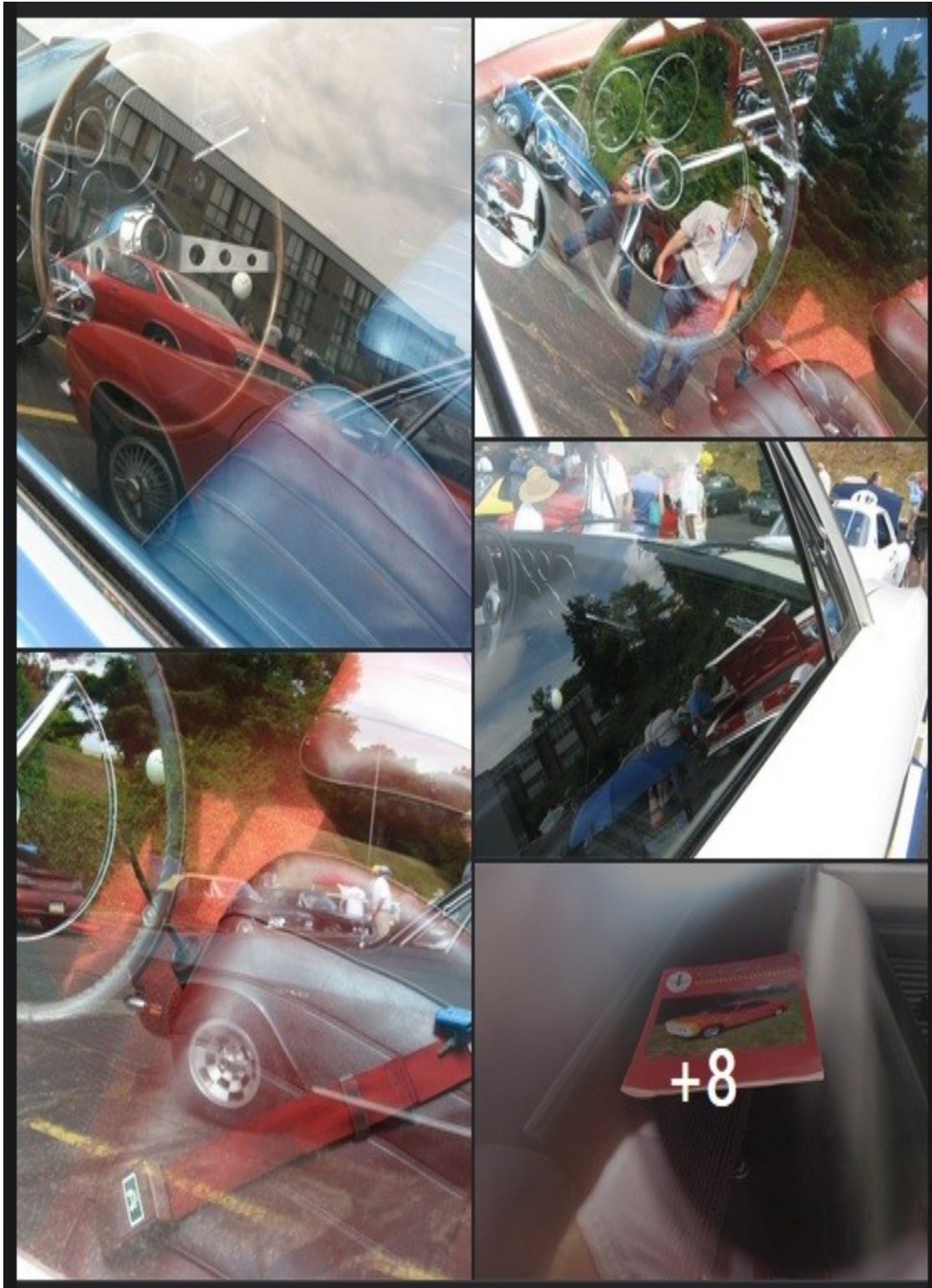
Just a few pics from 2018 CORSA National Convention .