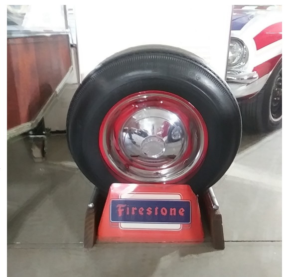
Inside the Corvair Museum, this tire display also describes the research that went into developing a "low" profile tire for the Corvair.

Spring is finally here! It feels like we've waited forever for its arrival. What Spring projects do you have planned? For myself, the list seems to get bigger every year! Come to think of it. I'm not finished with my winter projects yet. Now, we're less than two months away from the Mini-Convention to benefit the Corvair Preservation Foundation Corvair Museum! I don't know about you but, I'm excited for it! We can still really use all the help we can get! If you can't help us for any reason I understand. However, I encourage you all to participate in the fun! I certainly hope to be there as much as I can! I also hope you are able to make it to our April meeting. It'd be great to get some more cars out front during the meeting if we can! Oh. I just remembered we do need some door prizes for the Mini-Convention! Perhaps some quick detailer, some car wash or wax, maybe even an air freshener! The list could be endless. If you can't make it to the meeting I hope you get a chance to get your Corvairs out and give them a fresh drink of some ethanol free premium fuel