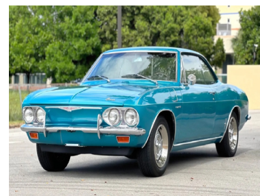
1965 Blue coupe. Buyer may have missed an opportunity. Bid to $20,250. Nice car with some questionable interior modifications