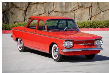
1960 red 4 door. Good price for a nice car