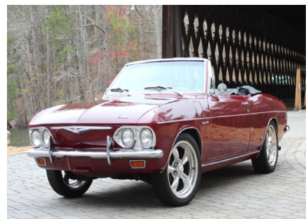
No sale, Bid to $12,000. Very nice car deserving of more dollars. 1965 maroon convertible