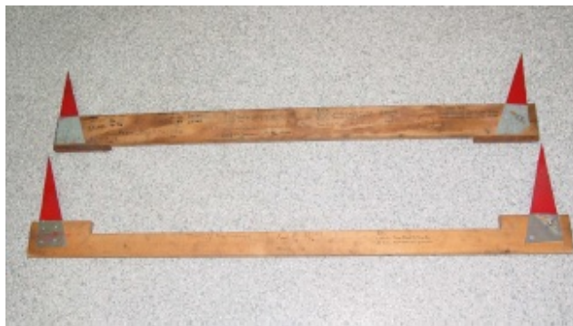
Toe In Trams For Cars and FC

Turn both sleeves backwards the exact same amount to bring the steering wheel back from the right without disturbing the toe-in.