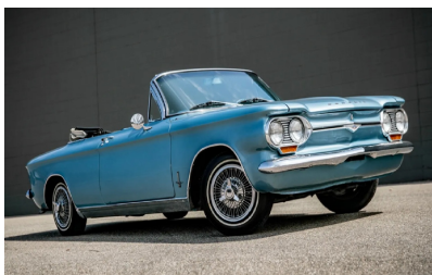
Nice Car at a nice price. Sold for $12,250, 1964 convertible, blue

Glen Rittenhouse follows sales on Bring-a-trailer. Last month he spotted these Corvairs listed on the site.