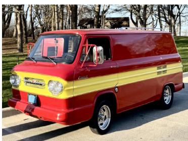
1961 Crovan, camper features. Bid to $9700. Worthy of more dollars to the right buyer