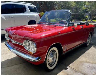
Another nice car at a nice price. Sold for $12,250. Note Wide White wall tires. 1964 convertible, red