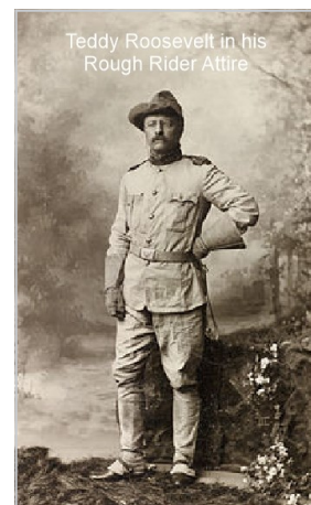
Teddy Roosevelt in his Rough Rider Attire

The Castaneda Hotel, a historical Fred Harvey House, has 18 rooms reserved for out-of-state attendees with a 2-night minimum. Overflow attendees will be directed to the historic Plaza Hotel. Call for Reservations: (505) 425-3591 for both hotels; mention "Corvair Tri-State" for our negotiated 15% discount; prices per night range from $84 to $143/night; payment collected upon reservation.