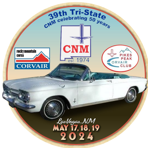
On the Cover: CNM 50th (top) | Logo for Tri-State Back of Shirt / (Right)