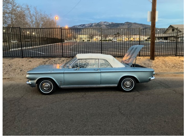
Continued on page 3