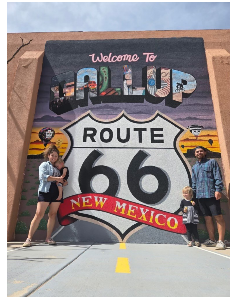
On the Cover: Rusty Corvair on a Route 66 Adventure