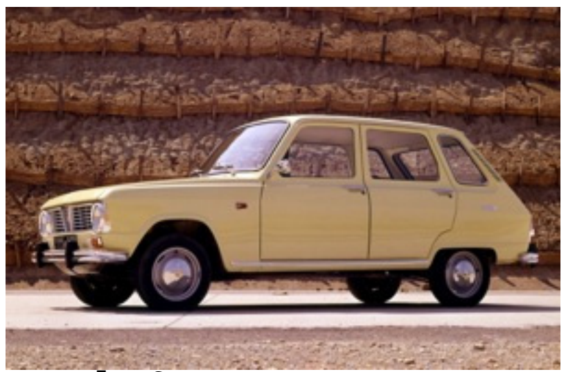
Renault 6 In 1968, the Renault 6 debuted; the second Renault to carry a Corvair Line.