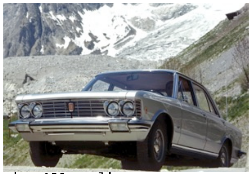
Fiat 130 Berlina In 1969 the final Corvair Lines of the decade appeared on two Fiat Group cars, the Fiat 130 and Autobianchi A111.