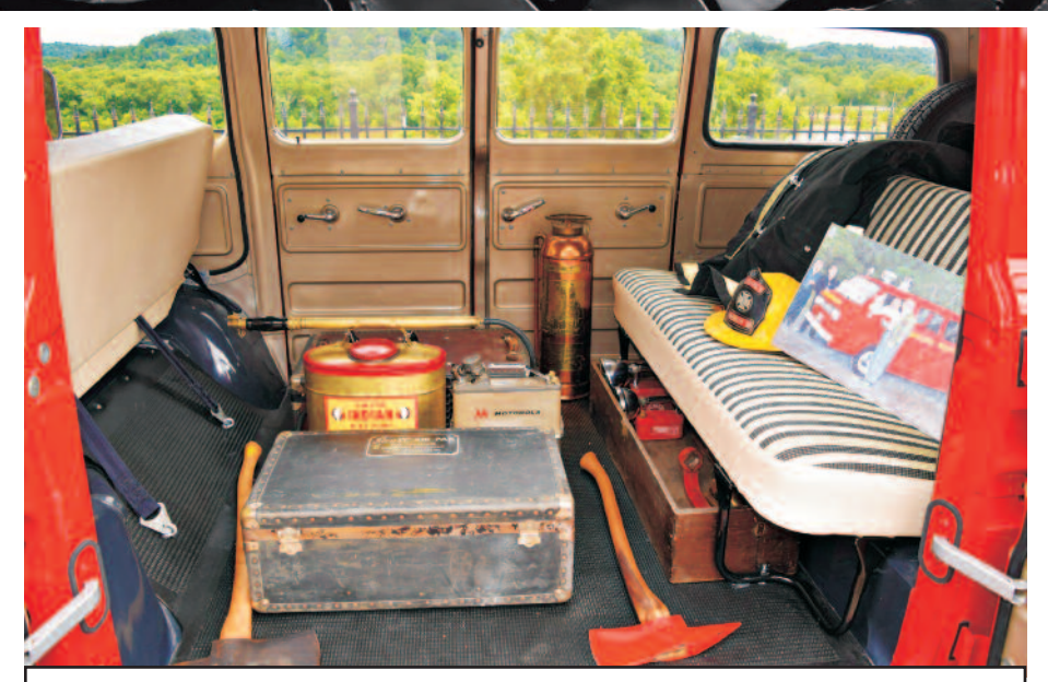
Load area with vintage firefighting and trauma equipment.

was trailered home for final reassembly.