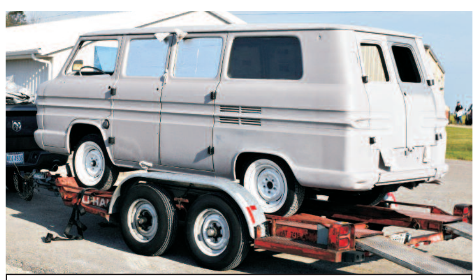
The Firebrier being trailered to state inspection station.

Unfortunately, the Firebrier was a testament to the limitations of the 102 HP engine in the Corvair 95. Holes in three of the pistons pointed to a long-term detonation problem. Holes in