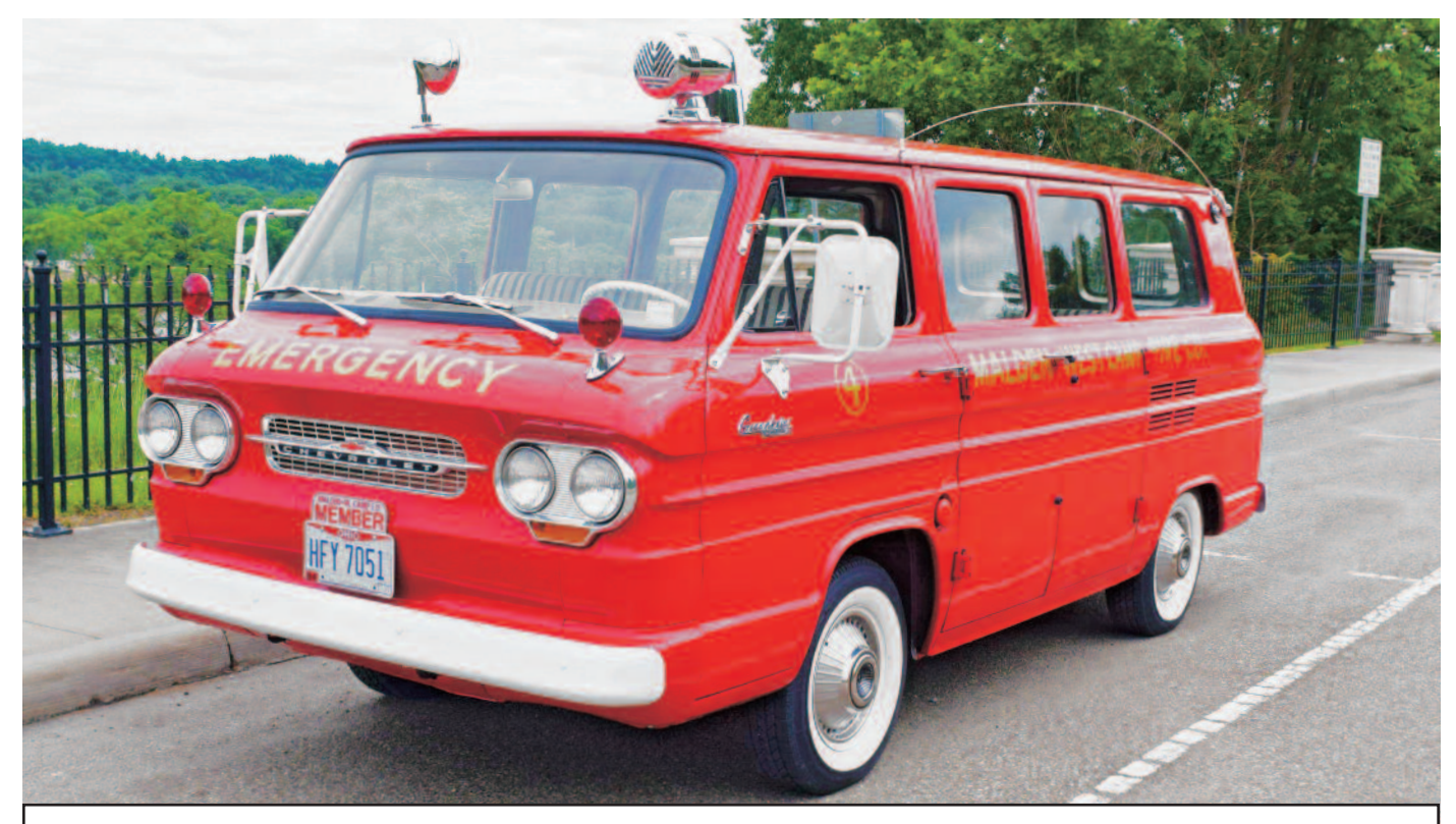
The restored Firebrier closely replicates its in-service configuration.

Company, the display includes a resuscitator, Smith Air-Pak breathing apparatus, fireman's axes, fire extinguisher, Indian fire tank, firemen's clothing, a mobile two-way radio, an assortment of Teledyne and Wheat spotlights, and other equipment typically needed at a fire scene.