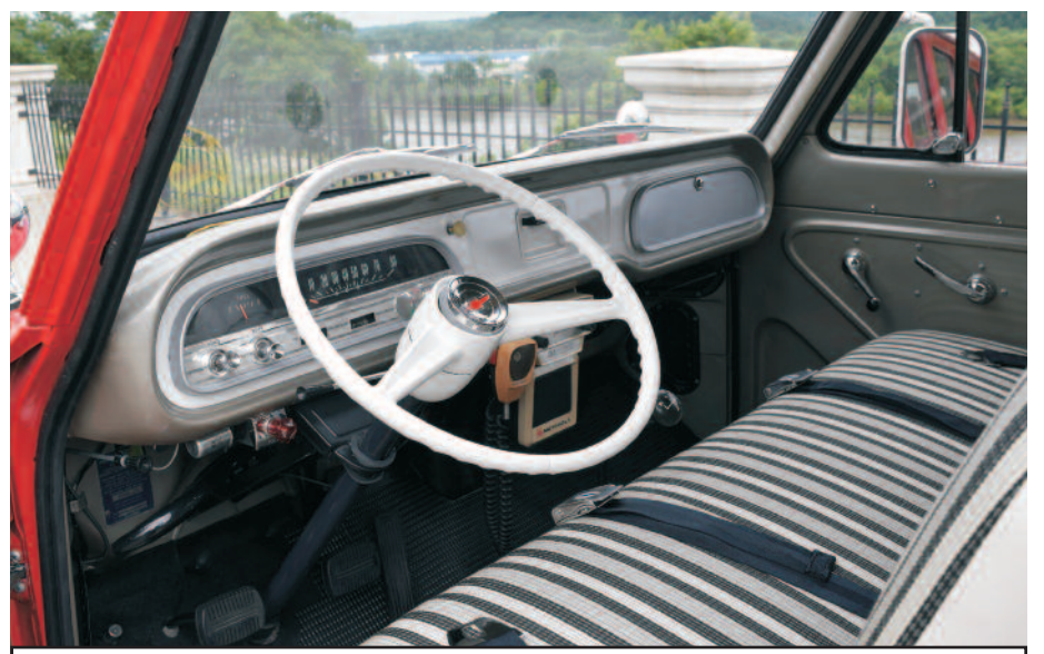
Restored cab. Notice Motorola Motrac radio head located in place of standard radio.

Having purchased the Firebrier sans title, I was rather anxious to secure one before transferring too much of the life savings into the project. In Ohio this requires negotiating a knotty judiciary process for obtaining a Court-Ordered Title. Along with the requisite paperwork and fees, there is a requirement that the vehicle be driven into an official state inspection garage under its own power. So beginning in March, 2017, I began to reassemble sufficiently for the Firebrier to be trailered 50 miles north to the nearest inspection station and then driven about 100 feet into the garage.