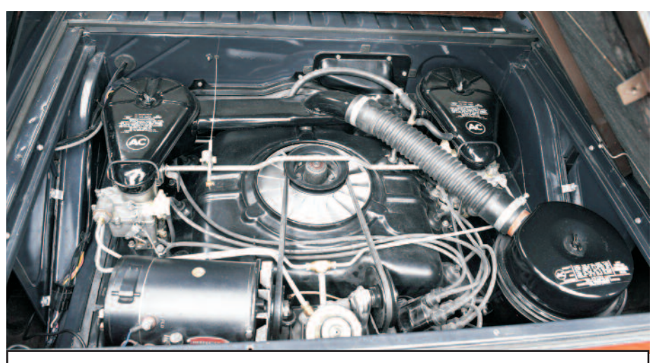
Engine restored with LCI generator and pre-oil bath air cleaner.

Finally the Firebrier was stocked with an assortment of vintage firefighting gear to show the types of equipment it once hauled. Some original to the Malden-West Camp