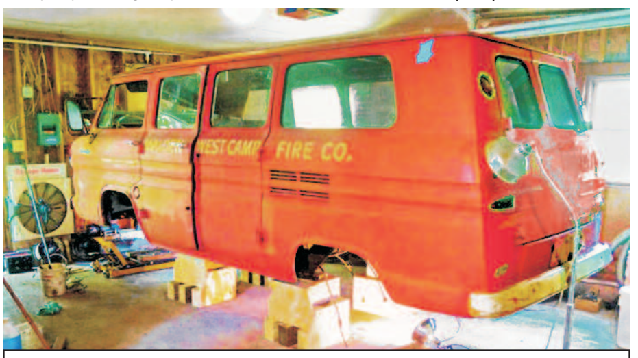
Van elevated on wooden pedestals in my garage for restoration.

in service for over two decades, and was typically packed "to the gills" with all the equipment it was intended to carry. As a brush truck it carried Indian fire tanks, firefighting rakes and metal brooms, a portable generator and water pump for brush and