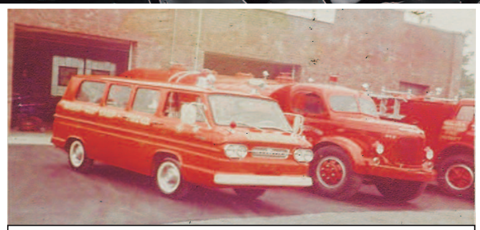
Malden-West Camp #4 on display at the September 1969 Open House in front of the West Camp Station. Also visible are one of the 1954 GMC pumpers and a new 1500 gallon engine that replaced the 1937 REO tank truck in 1968.

tion of its two firehouses, and for several years West Camp engines had been suppressing fires in Greene County on an ad hoc basis. After several months of negotiations, on July 22 the agreement was signed adding the Cementon Protective Fire District to Malden-West Camp's territory. The potential expansion of their fire protection territory was one reason the Malden-West Camp volunteers had for several months been discussing purchase of an additional vehicle.