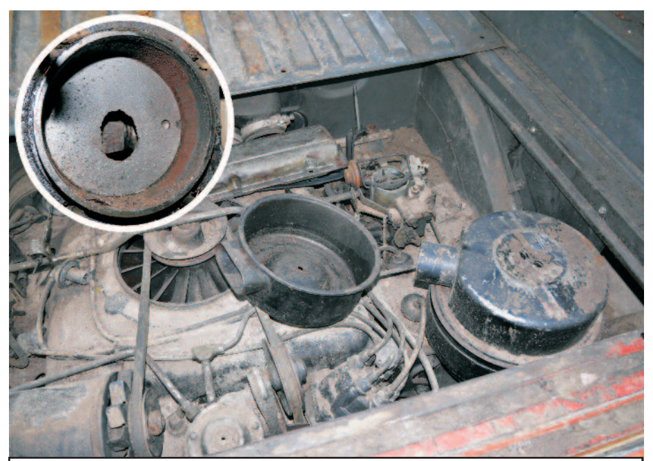
Engine as found in 2016. Inset shows one of the pistons with a detonation hole.

grass fires. For accident and trauma situations, there were the multiple resuscitators, four and ten ton hydraulic "porta power" extractors, first aid and other life-support kits. Other fire scene support gear included self-contained breathing apparatuses, smoke extractor, portable radio, lights, and more.