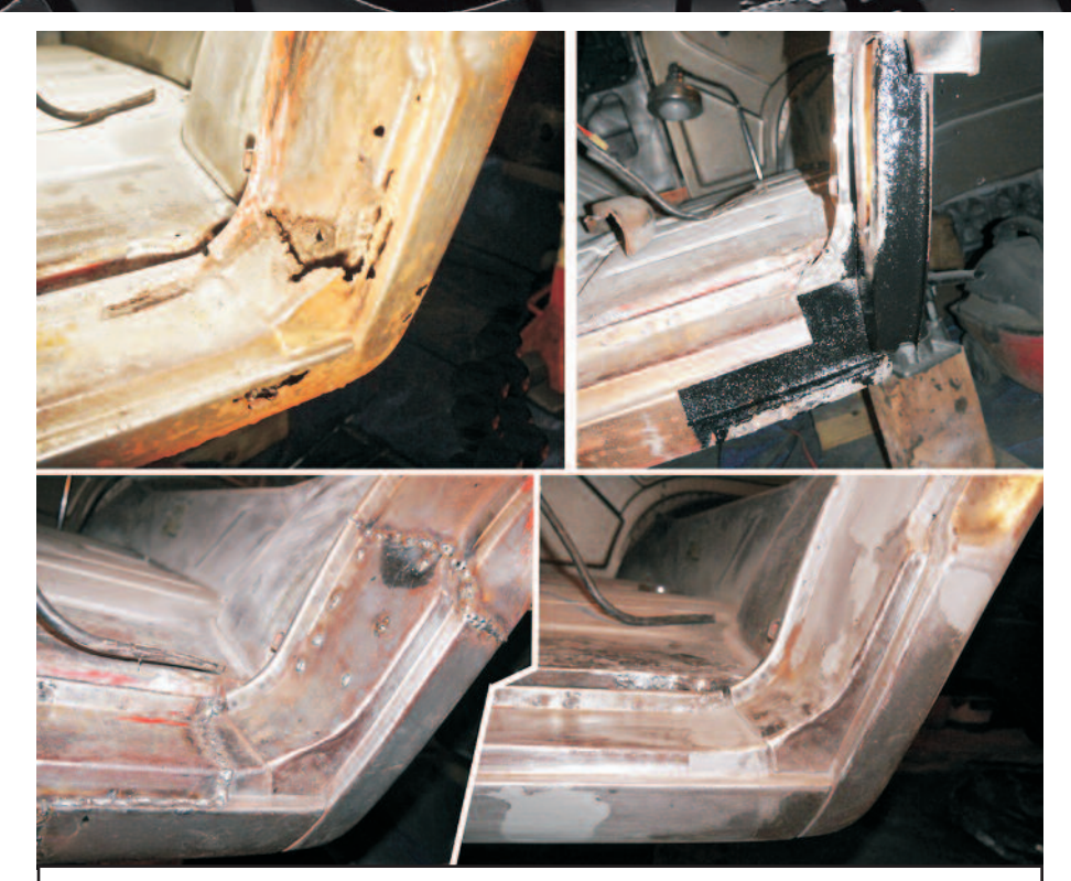
Front door dog-leg repair. Typical of several other areas, rotted metal was replaced with salvage parts when available.

From 1961 through mid-1963, an 80 HP Turbo-Air 6 was the only engine available for the Corvair 95. The air-cooled Corvair engine had 6 horizontally-opposed cylinders with crankcase and cylinder heads manufactured from cast aluminum. Its lightweight, compact design afforded excellent weight distribution to the vehicles while preserving cargo space above the engine compartment. By 1963, customers were clamoring for more muscle. 80 HP was double the output of the VW T1b Transporter's 4cylinder boxer engine, but stacked poorly against the 101 HP engine available to its nemesis, the Ford Econoline. An upgraded, longerstroke 95 HP engine would become standard for 1964 FC models, but for the remainder of '63, the best GM