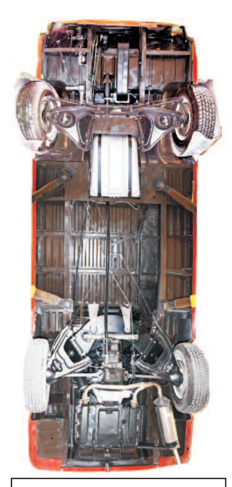
Photomerged image of the reassembled undercarriage.

three pistons!? Apparently near the end this poor engine was running, in effect, on four cylinders! Its ultimate demise culminated when shrapnel from the failed third piston was punched through the crankcase by a camshaft lobe. There would be no escaping a full rebuild. To add insult, the engine and undercarriage had been subsequently inundated at some time. Sediment covered the shrouding, was packed between fins of the pistons and heads, filled the lower shrouds, and even choked pushrod tubes left exposed sans valve covers. Mud was caked, sometimes rock hard, in almost every crevice of the