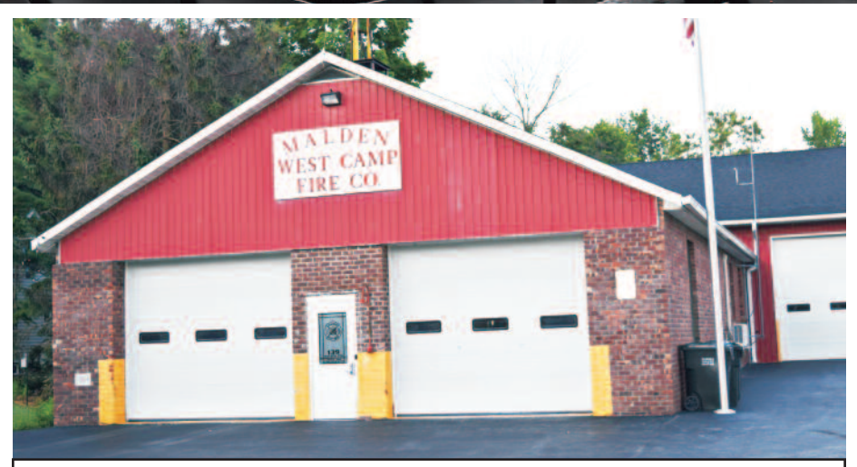
The Malden-West Camp fire house. Originally built with just the two forward bays, the rear addition was added later.

The Cementon area was paying $5,000 per annum for fire protection