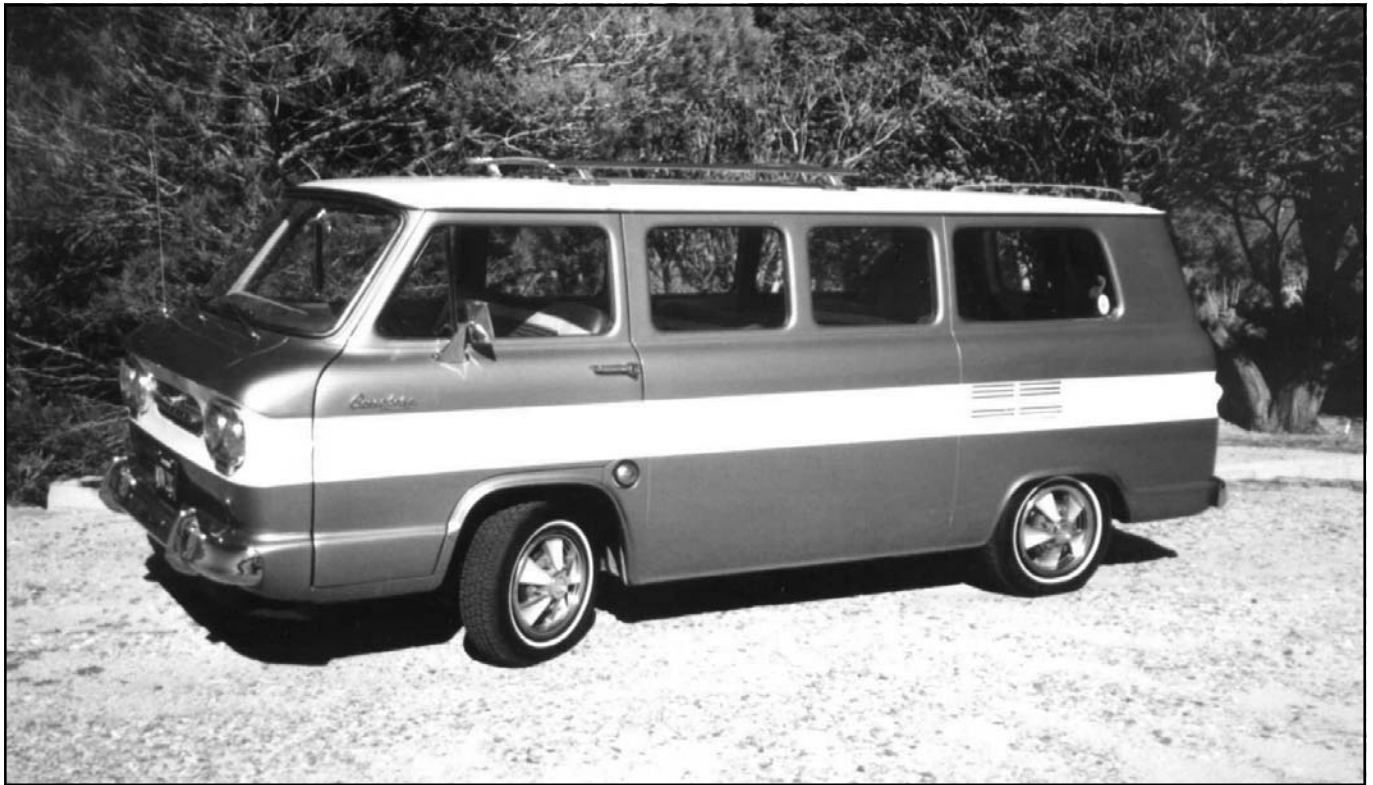
Jim Craig's Greenbrier features a Chevy wagon spoiler and aftermarket luggage rack.