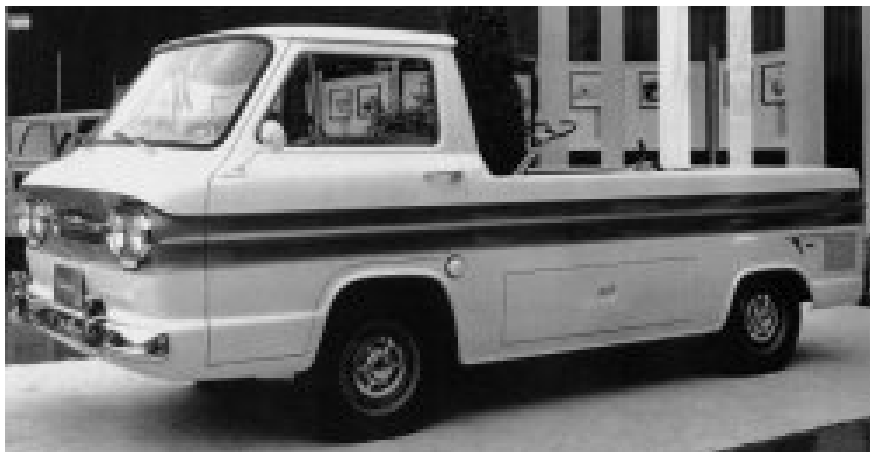
One of the early prototype Corvair 95 pick-up photos. If memory serves, I believe this was actually a Loadside

Sunday Show & Shine - Swap Meet - Raffle until 12 Noon