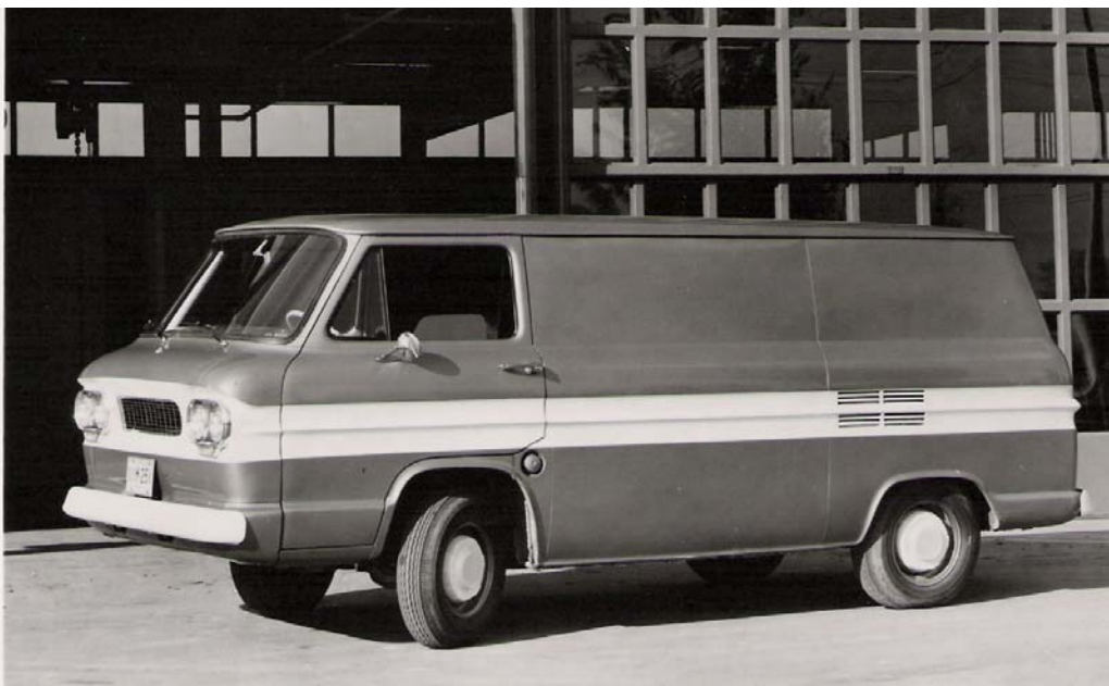
One of the 17 pictures donated by Ed Thompson at this year's convention.