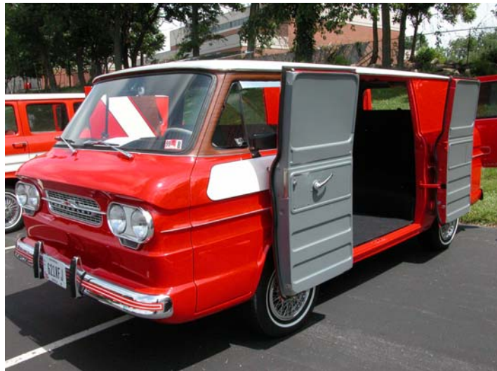
A FEW LEXINGTON SCENES