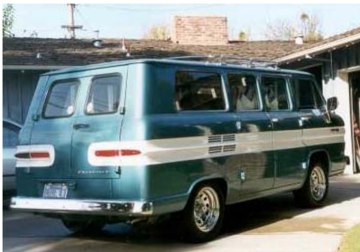
1965 Greenbrier #101242 owned by Spencer Duffy.