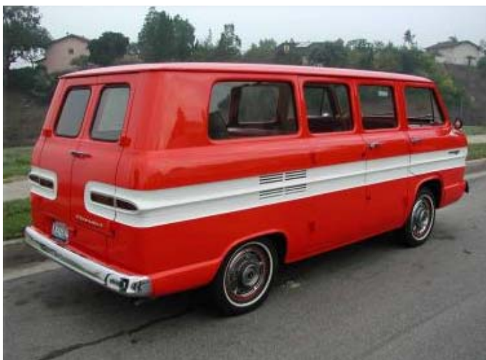
1965 Greenbrier #101000 owned by Dale Dewald.