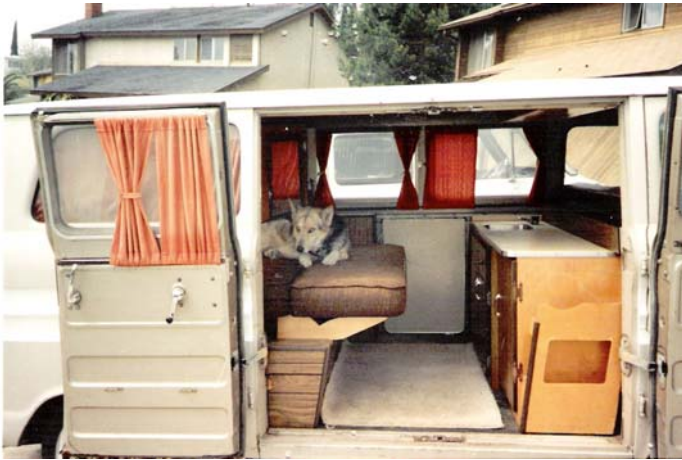
"Dawg" in his fancy doghouse—a 1962 Greenbrier!

Enclosed are pictures of a 1962 Greenbrier camper from 20 years ago. As you can see, the owner, "Dawg" has taken it as his home. Pretty fancy doghouse, eh? We leave the doors open all the time so that he has a place to keep dry during wet spells here in San Diego. We found "Dawg" at the Palm Springs Fan Belt Toss in the early eighties and he adopted us.