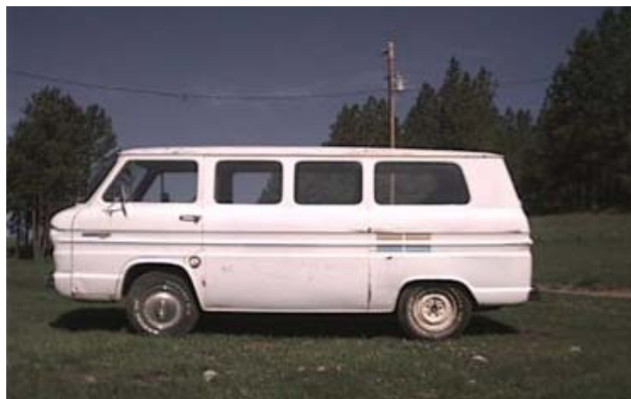
1965 Greenbrier #100734 owned by Bruce Gwyther.