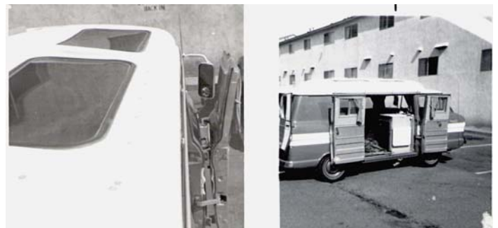
Two views of their 1964 Corvan with raised top.