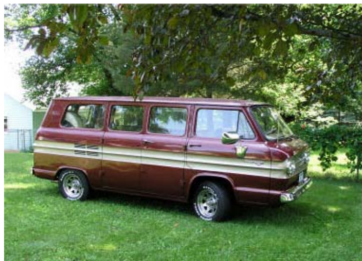
1965 Greenbrier #100642 owned by Doug Dunlap