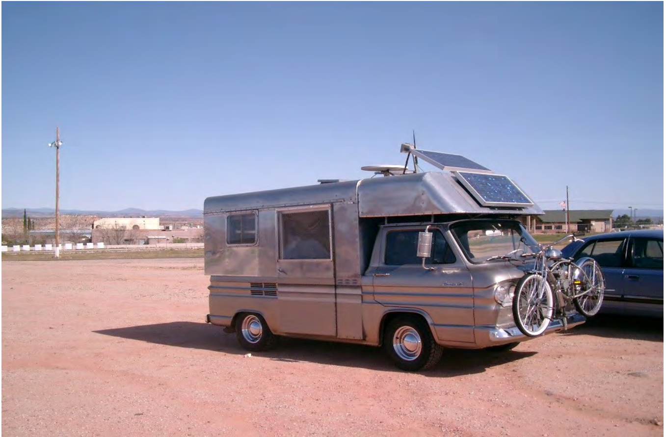
Photo of Corvair pickup camper taken Sat Mar 20 in parking area at Cottonwood,AZ Fairground. Let me know what you think of this getup. Solar panels and satellite antenna on the top

CORVANANTICS 4563 Deep grove Ct Jacksonville, FL 32224