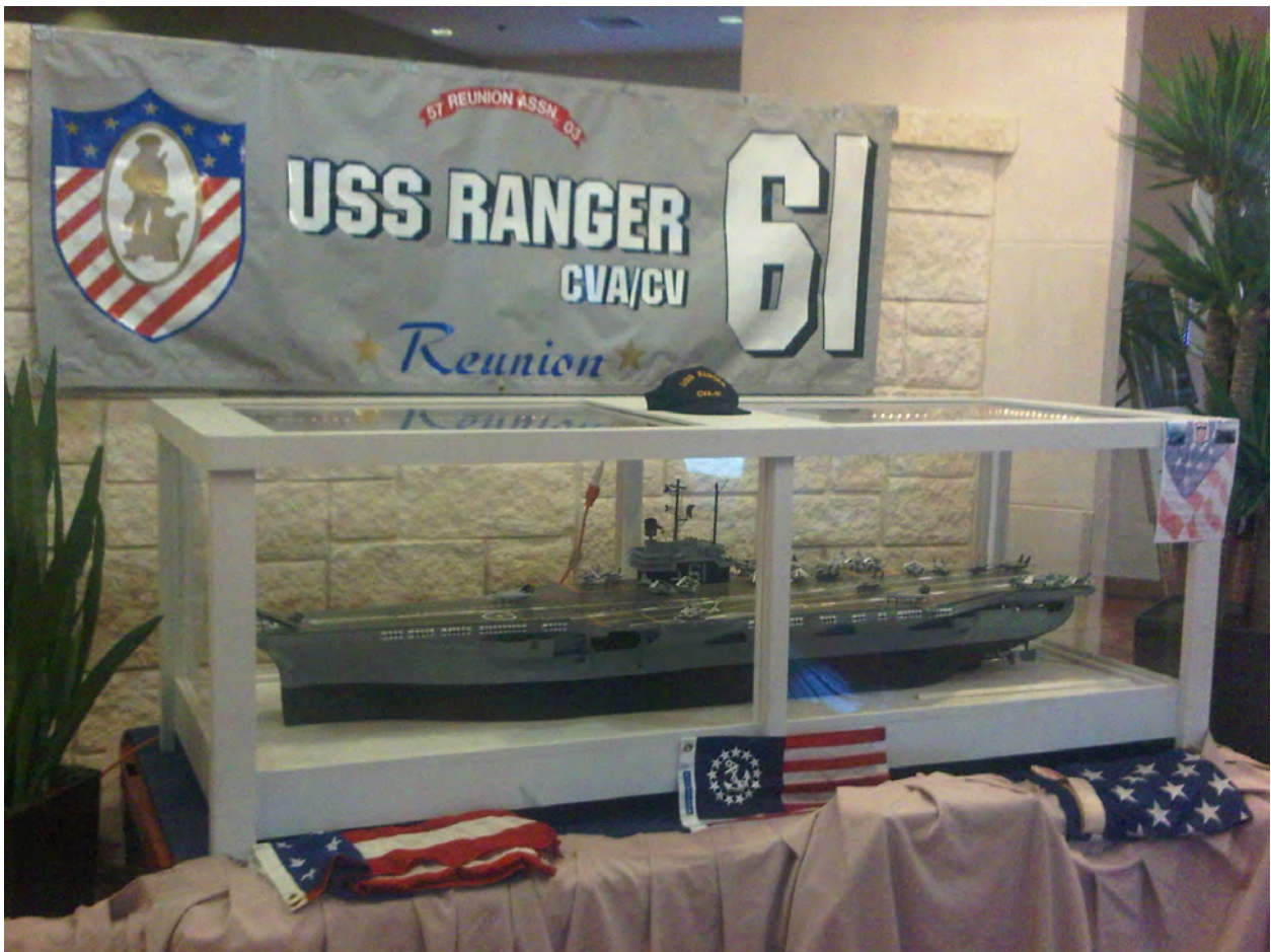
CARRIER MODEL ON ITS TRAILER AT THE HOTEL

Bottom line, these are tough old birds that come through when you need them. Don't be afraid to drive (and sometimes abuse) them.