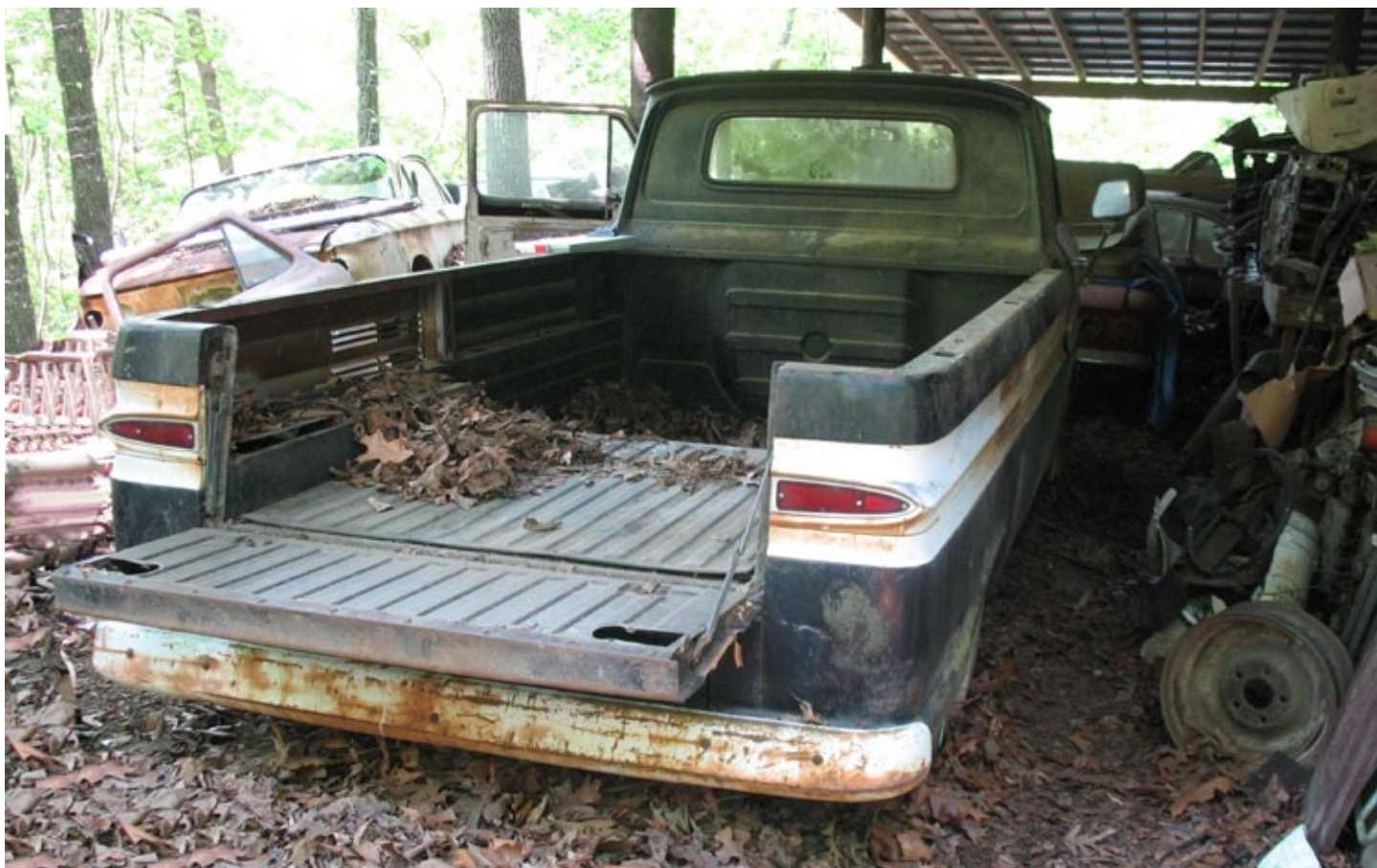
John Nickel found and purchased this 1962 Loadside, one of 369 built that year, at collection sale. See page 10 for story.