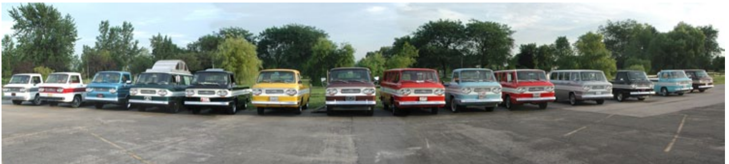
Panorama of FCs at the 2001 CorSA Convention in Chicago

see event schedule at the convention for room designation.