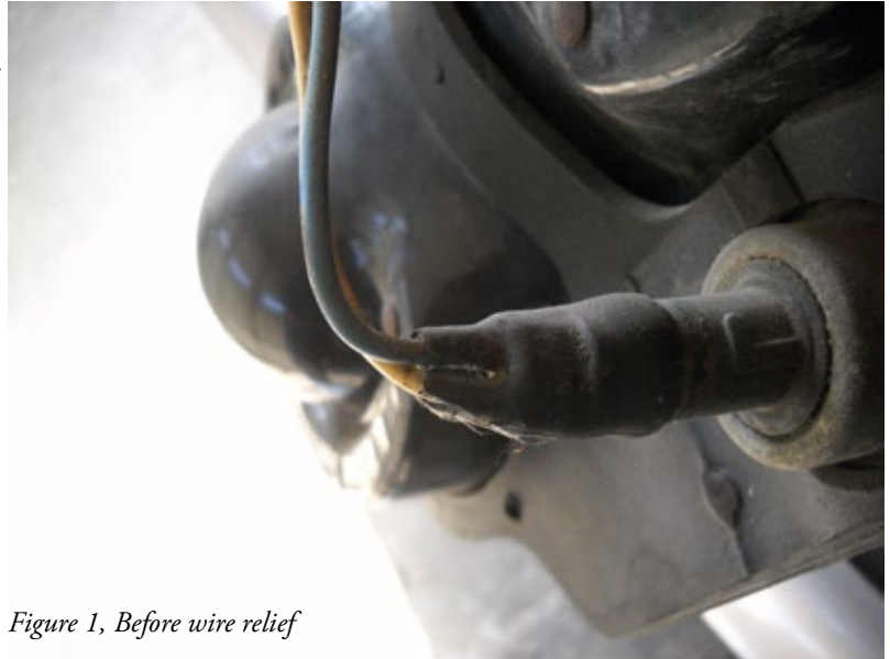
Figure 1, Before wire relief