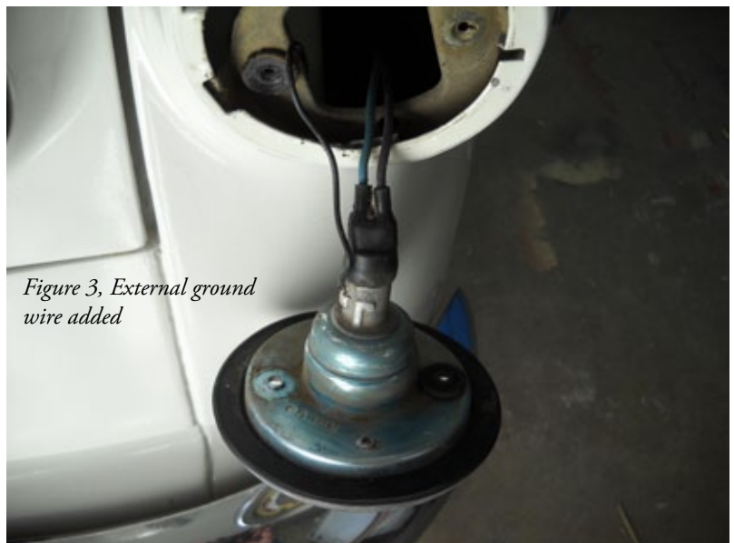
Figure 3, External ground wire added