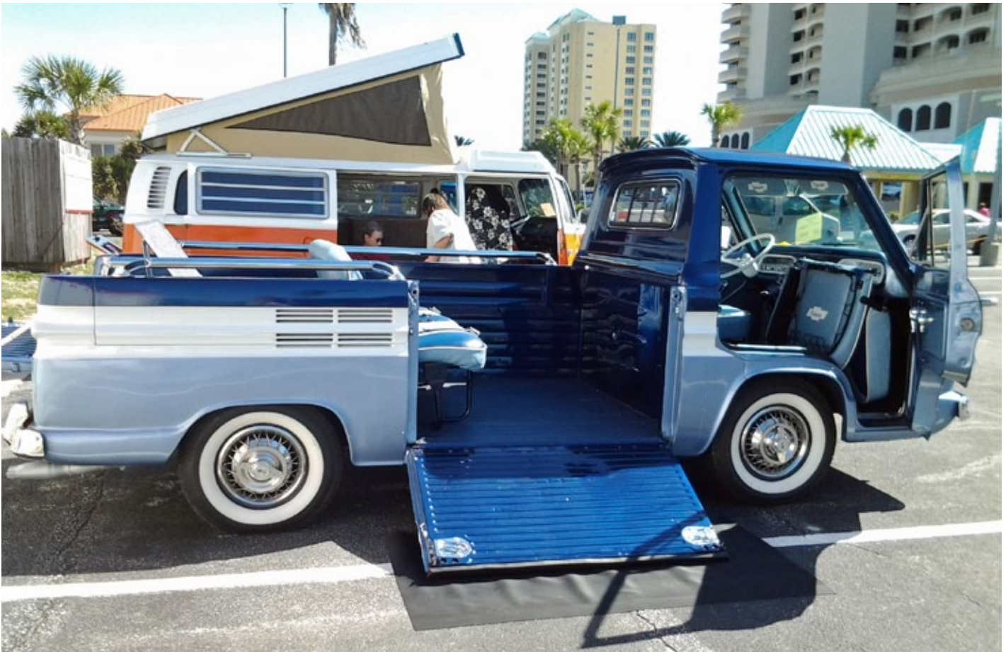
Karl Stelzer's 1963 Rampside, with a Corvair powered VW camper bus in the background.