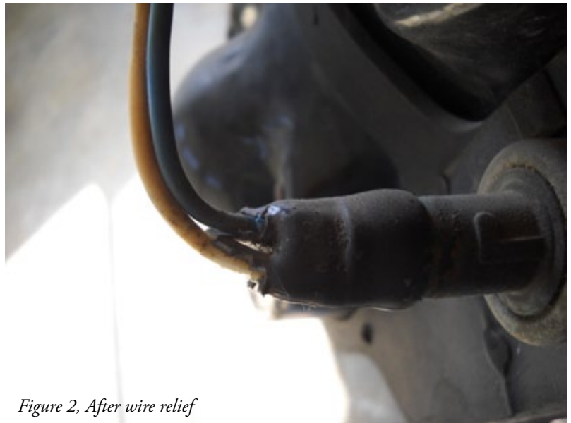
Figure 2, After wire relief