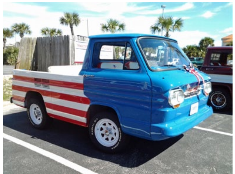
Russ Thuleen's shortened '61 Loadside