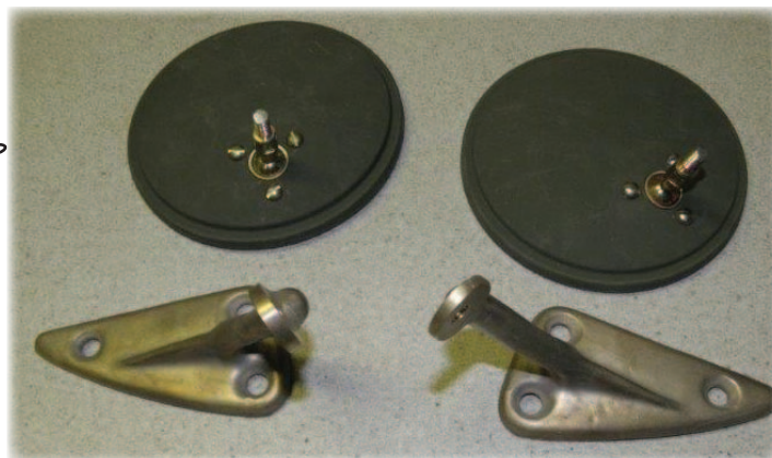
Out of the box, the brackets are bare brass, the mirror backs are painted drab army green.