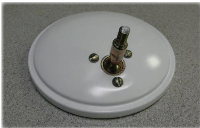
When painting the mirror back do not remove all three screws, the backing plate will fall inside the housing.