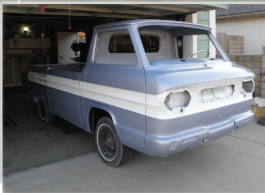
Mirrors prepped, painted and ready to go on Dave's Rampside restoration project.