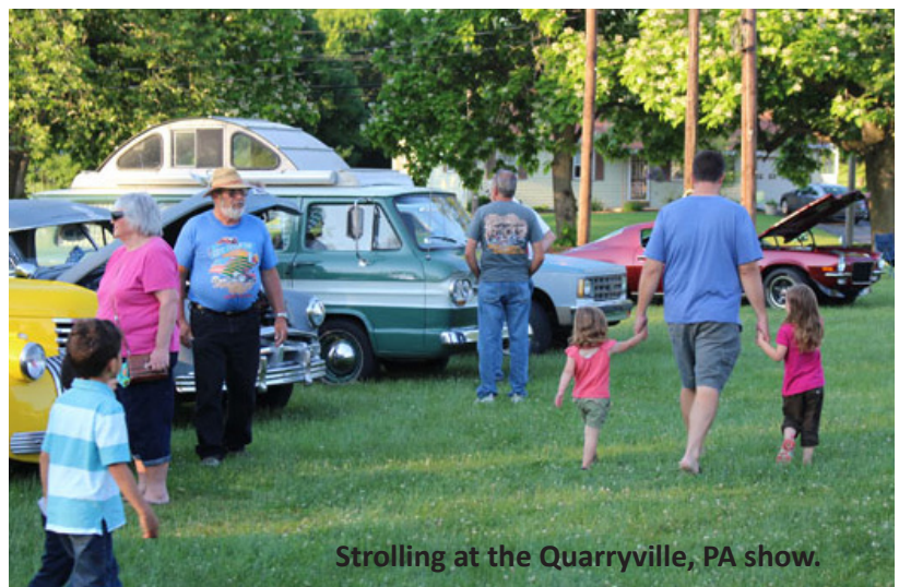
Strolling at the Quarryville, PA show.

The other car show we attended recently was held on June 13 at LCBC Church in Manheim, PA. With an estimated 2000 show cars in attendance, you can be sure to see just about any kind of vintage car out there. We were the only Corvair FC in attendance, though there were at least two Corvair cars and several vintage VWs in attendance, including three early split windshield buses, the German precursor to our beloved FC class.