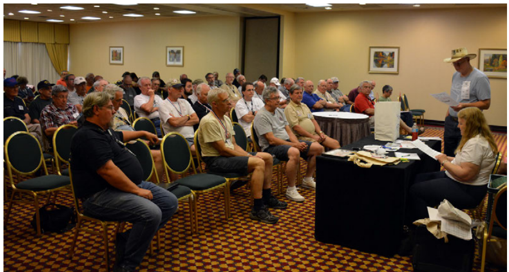
There weren't many easy seats left as Corvanatics members crowded into the meeting room at the Knoxville Marriott for the June 24th Annual Meeting.

The meeting was adjourned and door prizes were given away.