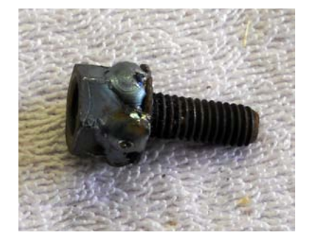
Extraction is easier once a nut is welded to the stubborn bolt.

What do you do when you need to loosen or remove the clutch head hinge bolts on your Ramside and the head is in too bad a shape for the tool to work without rounding the corners of the slot? Maybe you are repairing the rust area and have even tried cutting an opening in the outside of the ramp, heating the nuts and using your favorite brand of