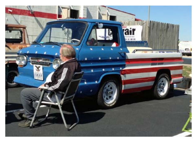
Russ Thuleen with his "Shortie" pickup.

from Page 9 (a form of bean bag toss), and eating lots of great homemade food. This is such a great event; include it on your Corvair bucket list.