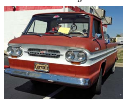
Dan Avallone's '63 Rampy.