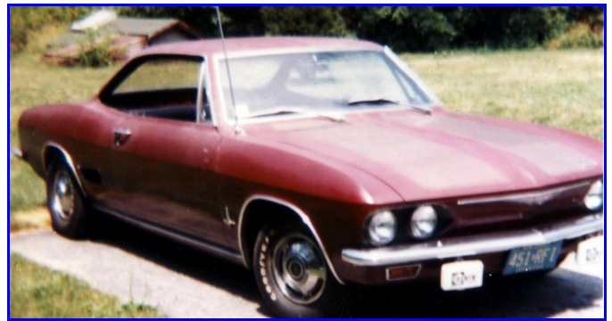
Frank's first Corvair, 1979.

The '65 Monza almost got me through college when a dropped valve seat sidelined the car. It