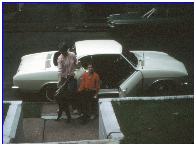
Aunt Marge's 1965 Monza. Not shown is the optional rainwear.